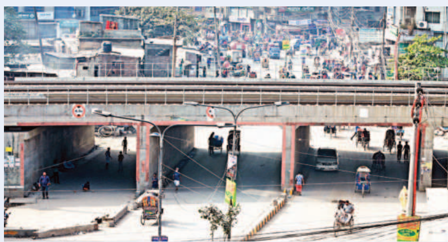
Rickshaws jostle with cars beneath a railway bridge while pedestrians make their way to their destinations. Once, a thriving canal flowed beneath this road, with boats loaded with goods docking at a nearby ghat. By the mid-1980s, the canal was transformed into a box culvert and is now buried underground.

But this once-vibrant waterway, like so many others in Dhaka, has succumbed to encroachment, neglect, and urbanisation.