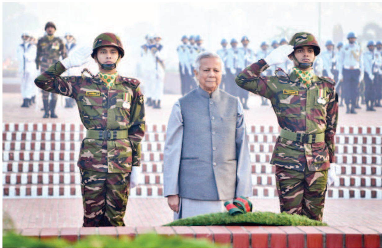
Chief Adviser Prof Muhammad Yunus placed a wreath at the National Memorial in Savar, honouring the martyrs of the 1971 Liberation War, marking Victory Day yesterday. People from all walks of life, and various political parties and organisations, including BNP, paid their tributes. The Anti-Discrimination Student Movement brought out a procession in Dhaka University area, while Bangladesh Jamaat-e-Islami staged a rally at the capital's Nayapaltn.