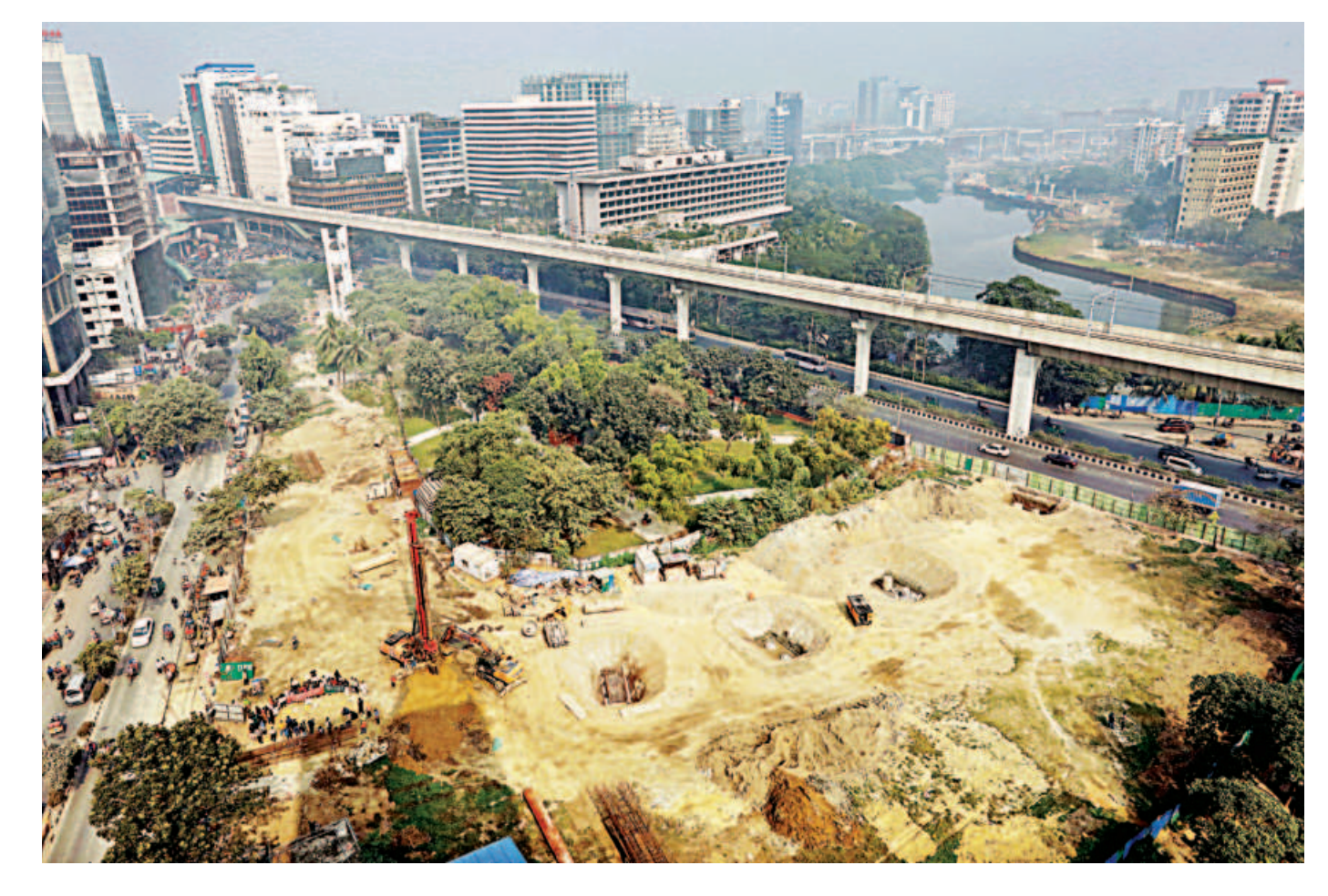
Construction work is going on at the Panthakunja Park near Sonargaon intersection in the capital. Bangladesh Gacch Rakkha Andolon demonstrated at the park yesterday demanding cessation of the construction work for an elevated expressway ramp that they said would destroy park.

Beximco has so far borrowed Tk 23,328 crore from the Janata, and SEE PAGE 6 COL 4