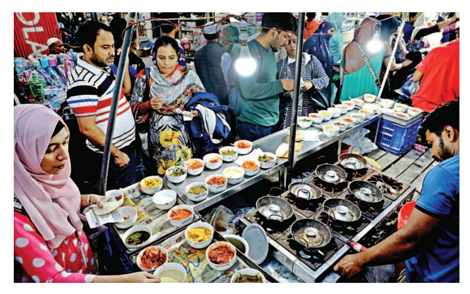
SELLING LIKE HOT CAKES...A sure sign of winter's arrival is the sight of people of all ages lining up at street vendors for traditional rice cakes. The photo shows customers crowding a roadside cake stall to indulge in these seasonal delicacies fresh off the stove in the capital's Farmgate area yesterday.