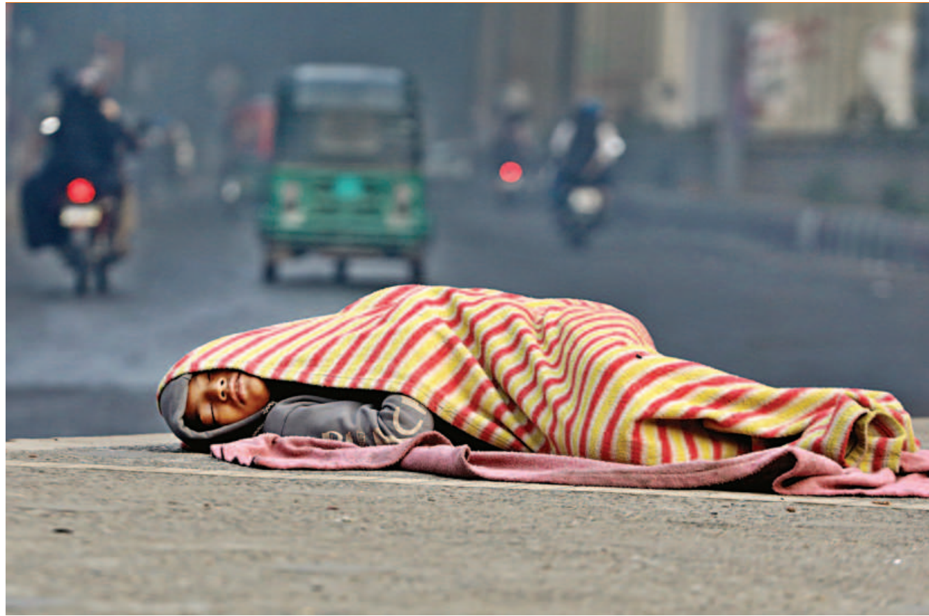
A homeless individual, wrapped in a hoodie and light quilts, spent his night at the foot of the Raju sculpture (not in picture) on the Dhaka University premises amid a cold spell that has gripped the country since Friday. The photo was taken around 7:00am yesterday.