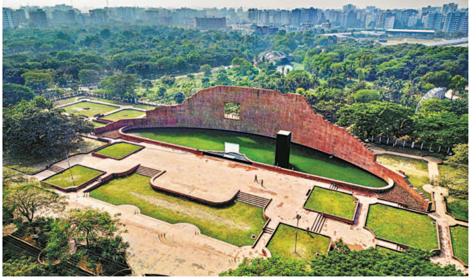
The Martyred Intellectuals' Memorial in the capital's Rayerbazar. The monument was designed by architects Farid U Ahmed and Jami Al Shafi to honour the luminaries who sacrificed their lives for the country's independence.