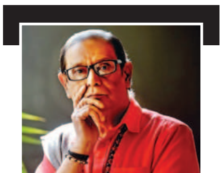
Helal Hafiz (1948-2024)