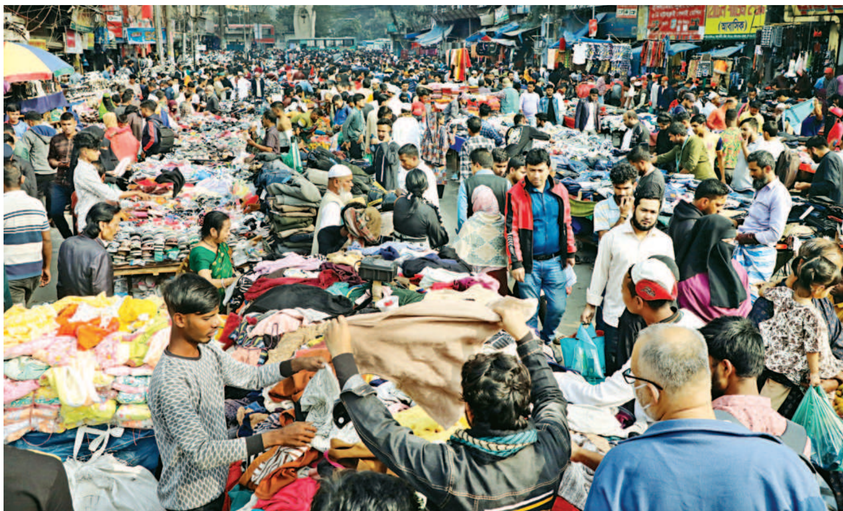
Gulistan's bustling sidewalks are lined with stalls offering winter wear at relatively lower prices. People from limited-income groups rely on these shops for their seasonal clothing needs. The photo was taken yesterday.