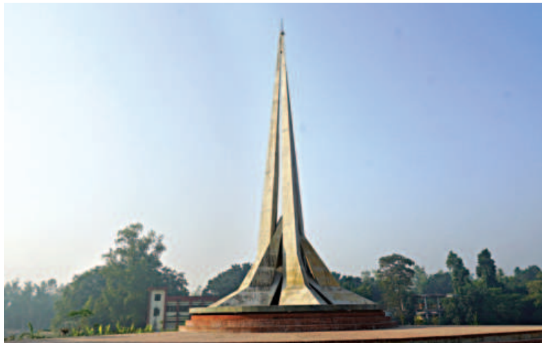
A memorial, near the Koddar intersection in Kamarkhand, Sirajganj, stands as a testament to the heroism and bravery of the Palashdanga Jubo Shibir fighters. Adjacent to the memorial is a list of the names of 485 freedom fighters who were part of this valiant force.