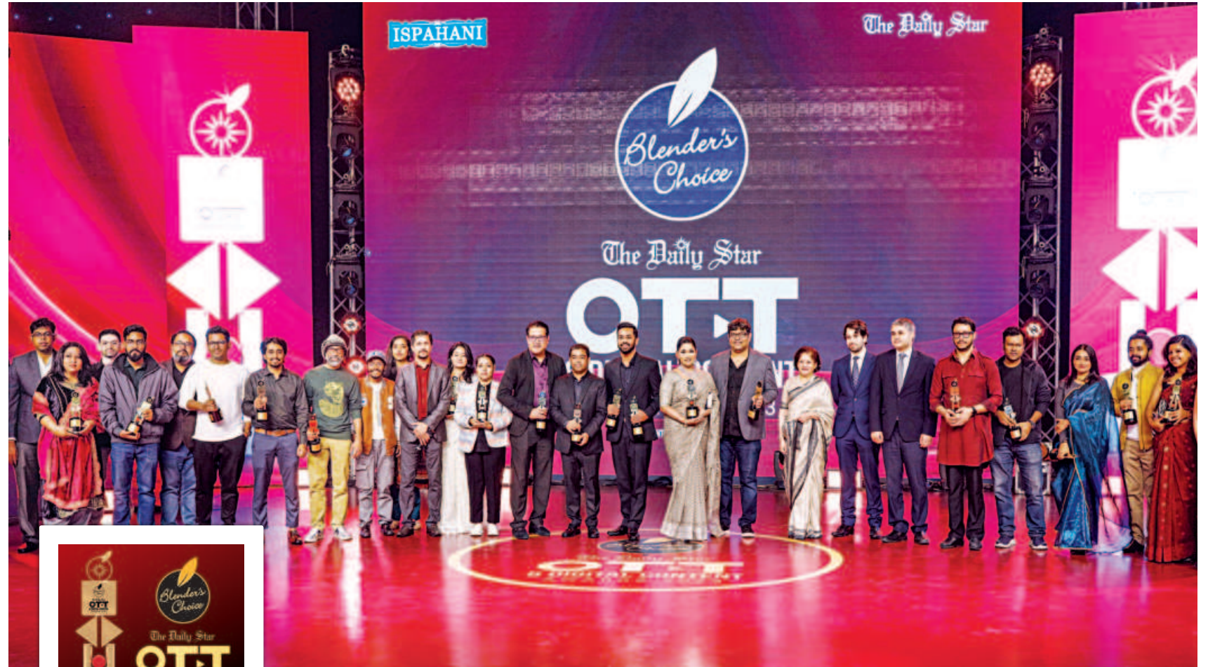
Awardees and directors of Ispahani Group pose for a photo at the Blender's Choice-The Daily Star OTT and Digital Content Awards 2023 held at Bangabandhu International Conference Centre in the capital yesterday.