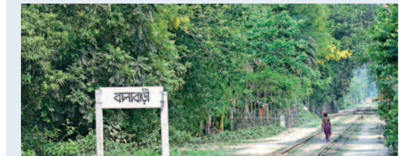
Recent photo of Balabari railway station in Chilmari upazila of Kurigram. Here, Aftab Bahini fought the Pakistani army on October 17, 1971.