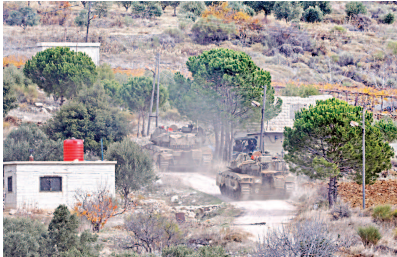
Israeli military forces in the buffer zone with Syria near the Druze village of Majdal Shams in the Israel-annexed Golan Heights yesterday.