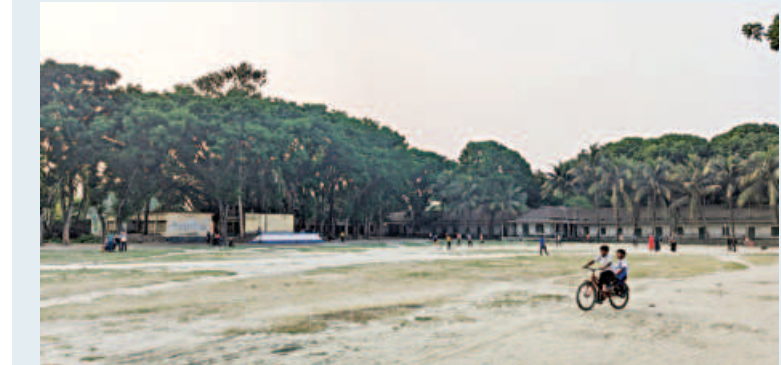
Recent photo of Rowmari CG Zaman High School ground. During the war, this was the biggest training camp in the country. Here, around 30,000 freedom fighters were trained.