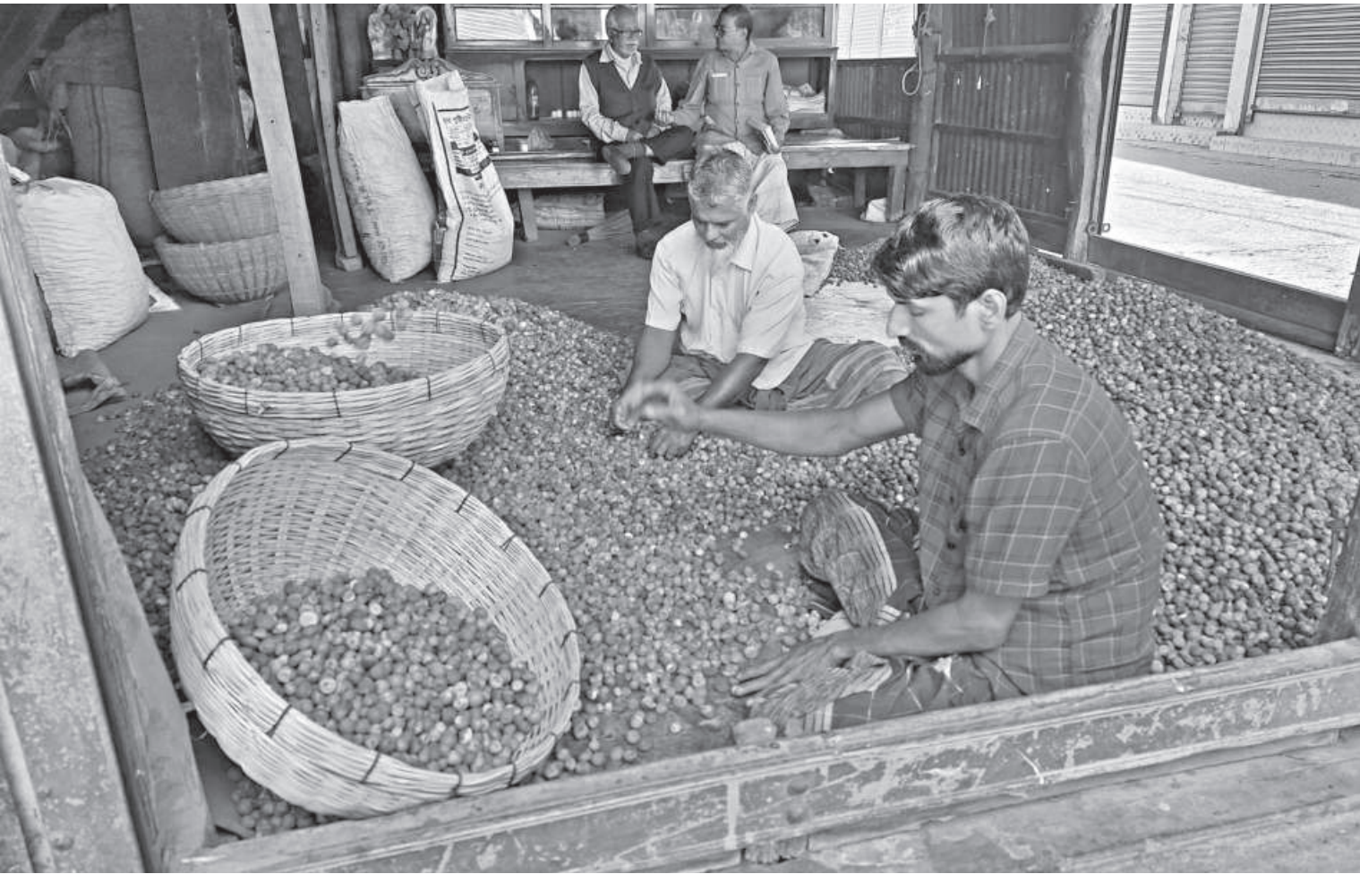
Workers are busy processing peeled and dried betel nuts at a wholesale market in the Jagannathkathi Sadar Road area of Pirojpur's Swarupkathi upazila. Working there from dawn to dusk, each worker earns Tk 800-1,000 daily. These betel nuts are sold to wholesalers for Tk 300 to Tk 400 per kg. The photo was taken recently.