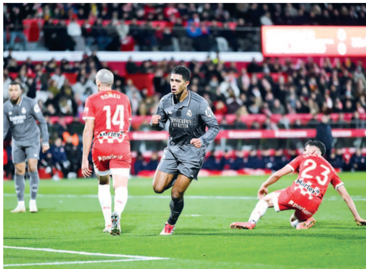
Jude Bellingham put on an inspirational performance during Real Madrid's 3-0 LaLiga win away to Girona on Saturday. Bellingham opened the scoring before half-time and set up Turkish playmaker Arda Guler for Madrid's second before Kylian Mbappe produced a clinical finish for their third. The win saw Los Blancos cut the gap on league leaders Barcelona to two points after the Catalans drew 2-2 at Real Betis earlier on the day, with Madrid having played one fewer match.