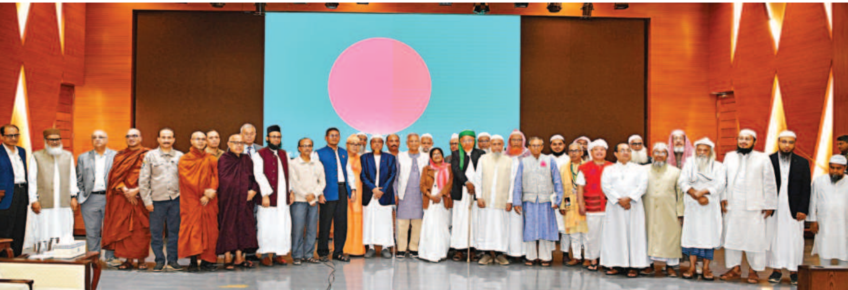
Leaders from different religious communities pose for a photo with Chief Adviser Prof Muhammad Yunus after a dialogue at the capital's Foreign Service Academy yesterday afternoon.