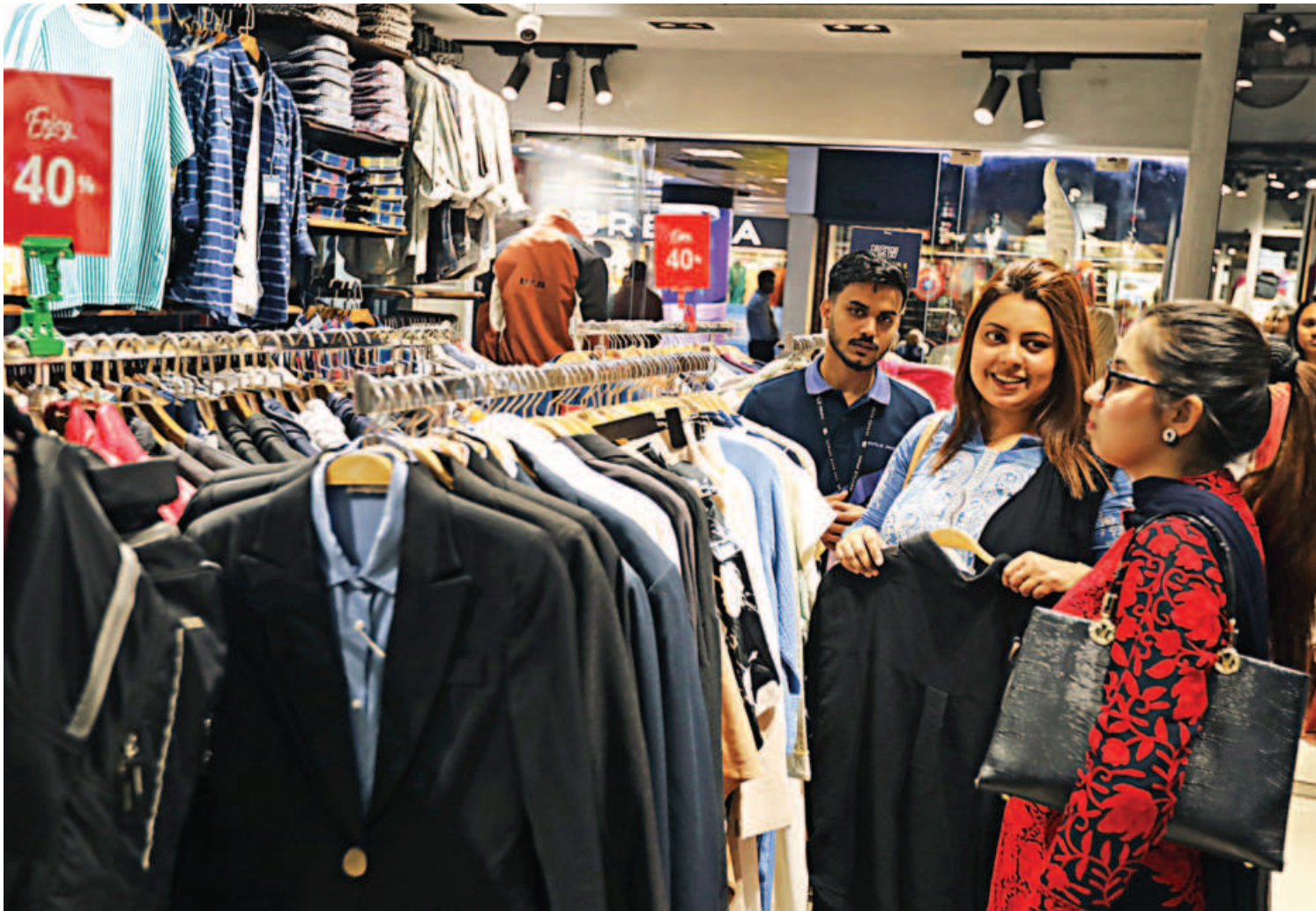
Fashion brands at Bashundhara City Shopping Complex in Dhaka offered discounts of 20 to 70 percent on winter apparel and remaining summer stock, enticing shoppers with a “Black Friday” spree.

Although both the ships became unfit by 2015, the BSC continued to operate them, as it failed to purchase new ones, according to the merchant mariners.