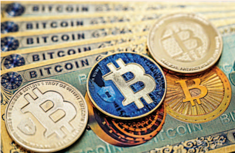
This illustration shows physical banknotes and coin imitations of the Bitcoin cryptocurrency.

He would replace Gary Gensler, who led a crackdown on the sector after a