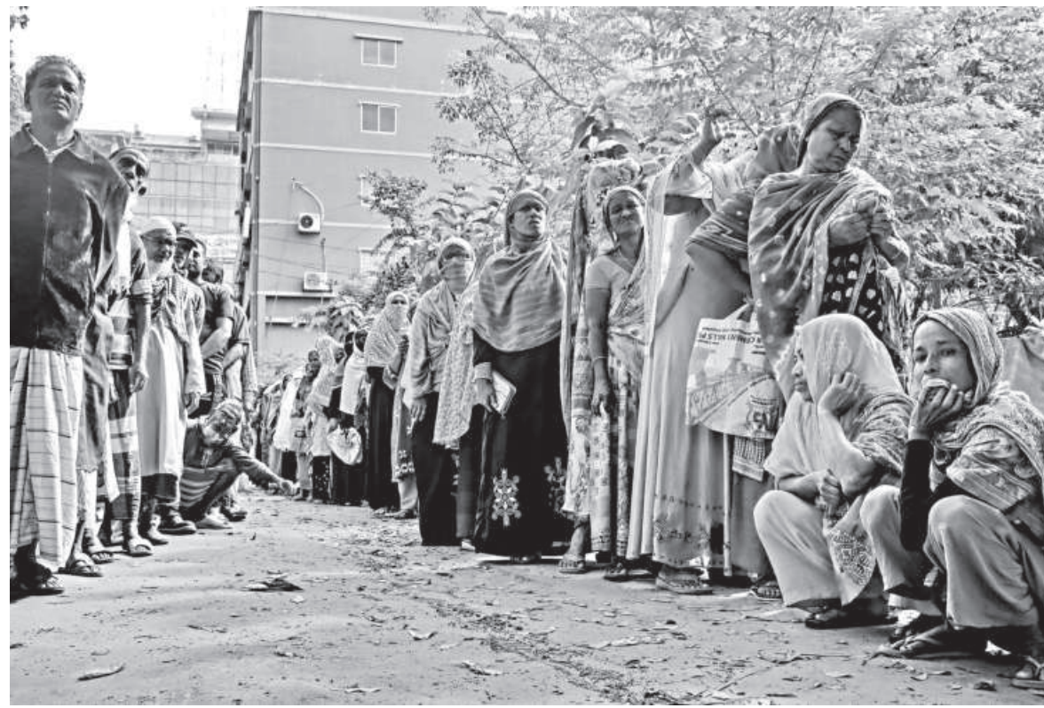
People form long queues from early morning to buy essential products at subsidised prices. The Department of Agricultural Marketing has established distribution hubs across Khulna city, offering bundles containing eggs, potatoes, onions, and other items for Tk 350. This photo was taken in the city's Shibbari yesterday.

The OC said, "We have been informed that the weapon recovered in the murder of a young woman in Munshiganj was looted from Wari Police Station. We are investigating the matter."