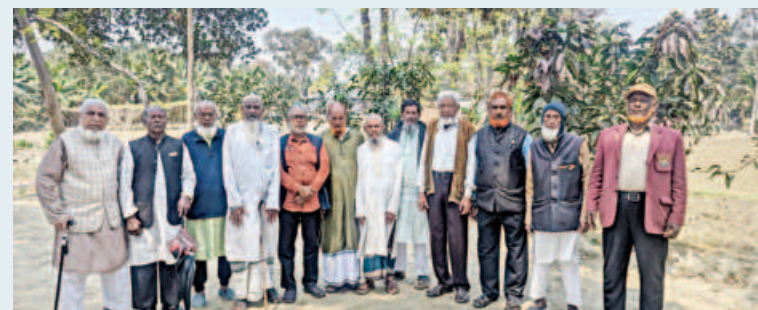
Recent photo of Sreepur Bahini members.