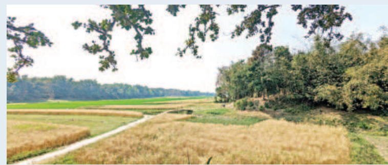
Recent photo of Alfapur village on the bank of Kumar river in Jhenaidah's Shaikupa. Here 55 Pakistani soldiers died in a battle with Sreepur Bahini on August 4, 1971.