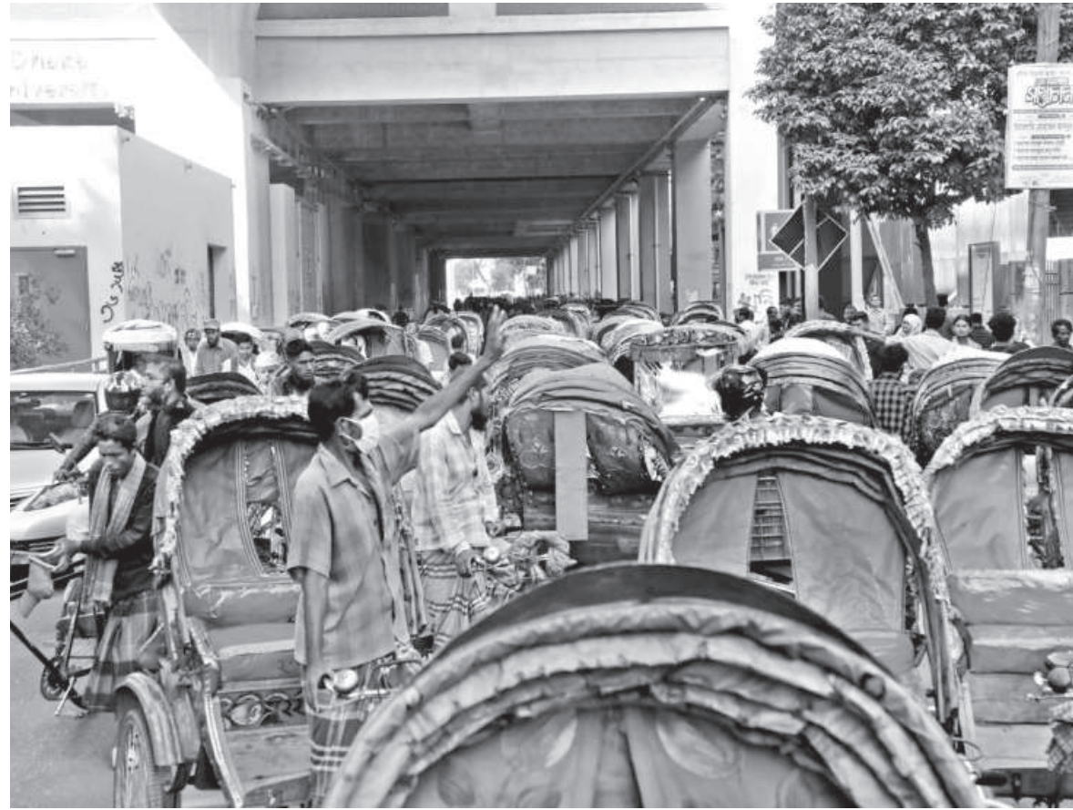
Rickshaws crowd multiple lanes beneath the Dhaka University metro rail station, leaving little space for other vehicles and causing traffic congestion. The photo was taken yesterday.