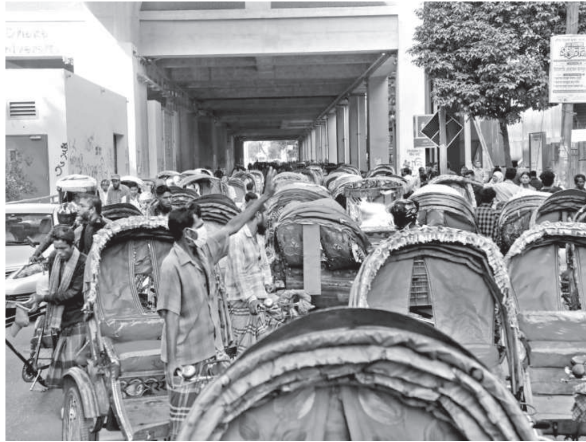
Rickshaws crowd multiple lanes beneath the Dhaka University metro rail station, leaving little space for other vehicles and causing traffic congestion. The photo was taken yesterday.