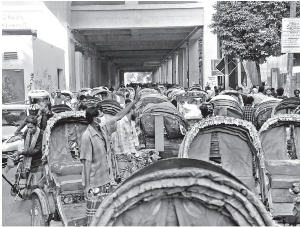
Rickshaws crowd multiple lanes beneath the Dhaka University metro rail station, leaving little space for other vehicles and causing traffic congestion. The photo was taken yesterday.