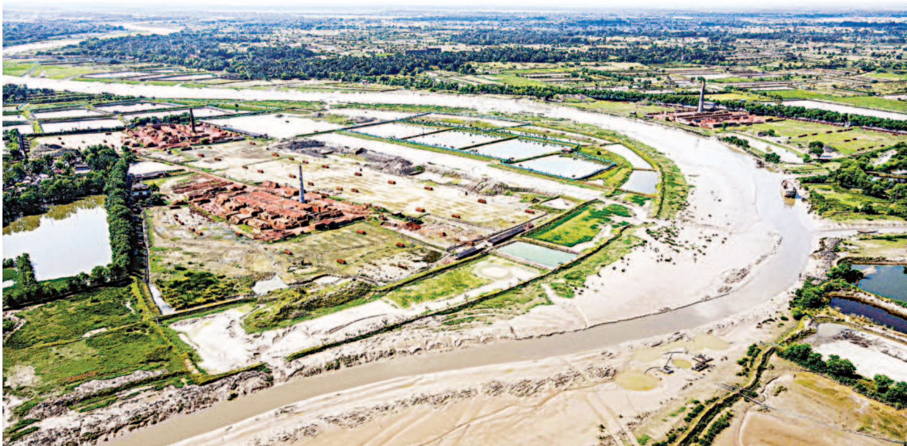
Brick kilns have been set up, and at least 25 fish farming ponds have been dug, encroaching upon the Sholmari river in Khulna's Botiaghata upazila. According to locals, this encroachment began about 10 years ago, causing damage to the biodiversity of the river. The photo was taken in the Chak Sholmari area recently.