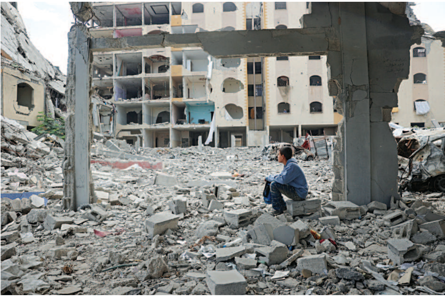
A Palestinian boy sits amid the destruction as displaced residents return to Nuseirat in the central Gaza Strip after Israeli shelling of the camp stopped yesterday.