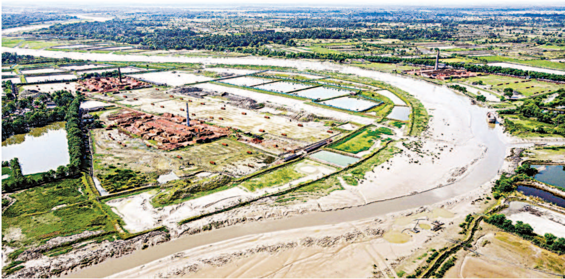
Brick kilns have been set up, and at least 25 fish farming ponds have been dug, encroaching upon the Sholmari river in Khulna's Botiaghata upazila. According to locals, this encroachment began about 10 years ago, causing damage to the biodiversity of the river. The photo was taken in the Chak Sholmari area recently.