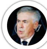
Real Madrid coach Carlo Ancelotti on Mbappe's form.

"It's a difficult moment for him, we've got to support him and give him our love, he'll soon be fine. People miss penalties, it happens a lot. It could be a lack of confidence maybe. You can't put too much grief on him for that,"