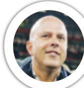
Liverpool coach Arne Slot on what the win against Real meant for The Reds.

"You know how special it is to play against a club that won this Champions League so many times, are the reigning champions and were a pain in the ass for Liverpool many times as well,"