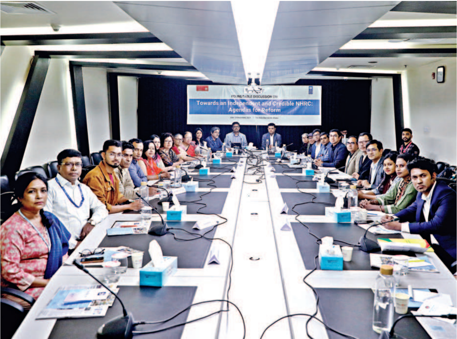
Discussants at a roundtable titled "Strengthening NHRC: Towards an Independent and Credible Oversight Body", jointly organised by UNDP and The Daily Star at The Daily Star Centre in Dhaka yesterday.

Ashraf said infrastructure should not only be functional, but should also serve as a tool for healing. "Buildings should be designed in a way that preserves nature," SEE PAGE 4 COL 7