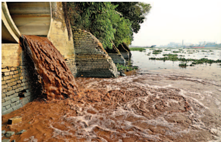
Liquid waste from chemical and dyeing factories being discharged into the Buriganga in the capital's Shyampur area. Several fish species in the river have all but disappeared. The photo was taken recently.