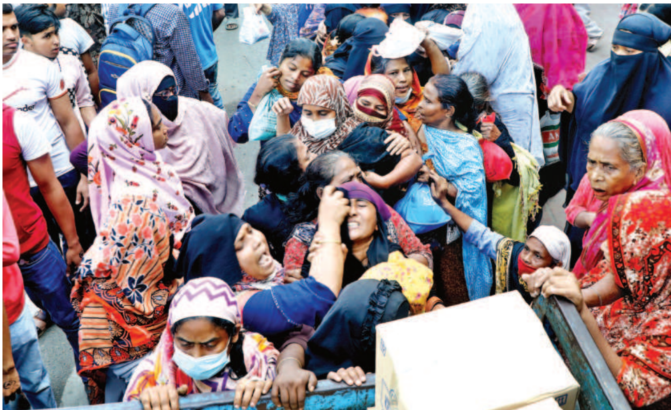
After having been waiting since 7:00am, these women from lower-income groups engage in a scuffle as desperation runs high for their share of kitchen essentials at subsidised prices from a TCB truck on the capital's Manik Mia Avenue. The truck arrived around 12:00pm.