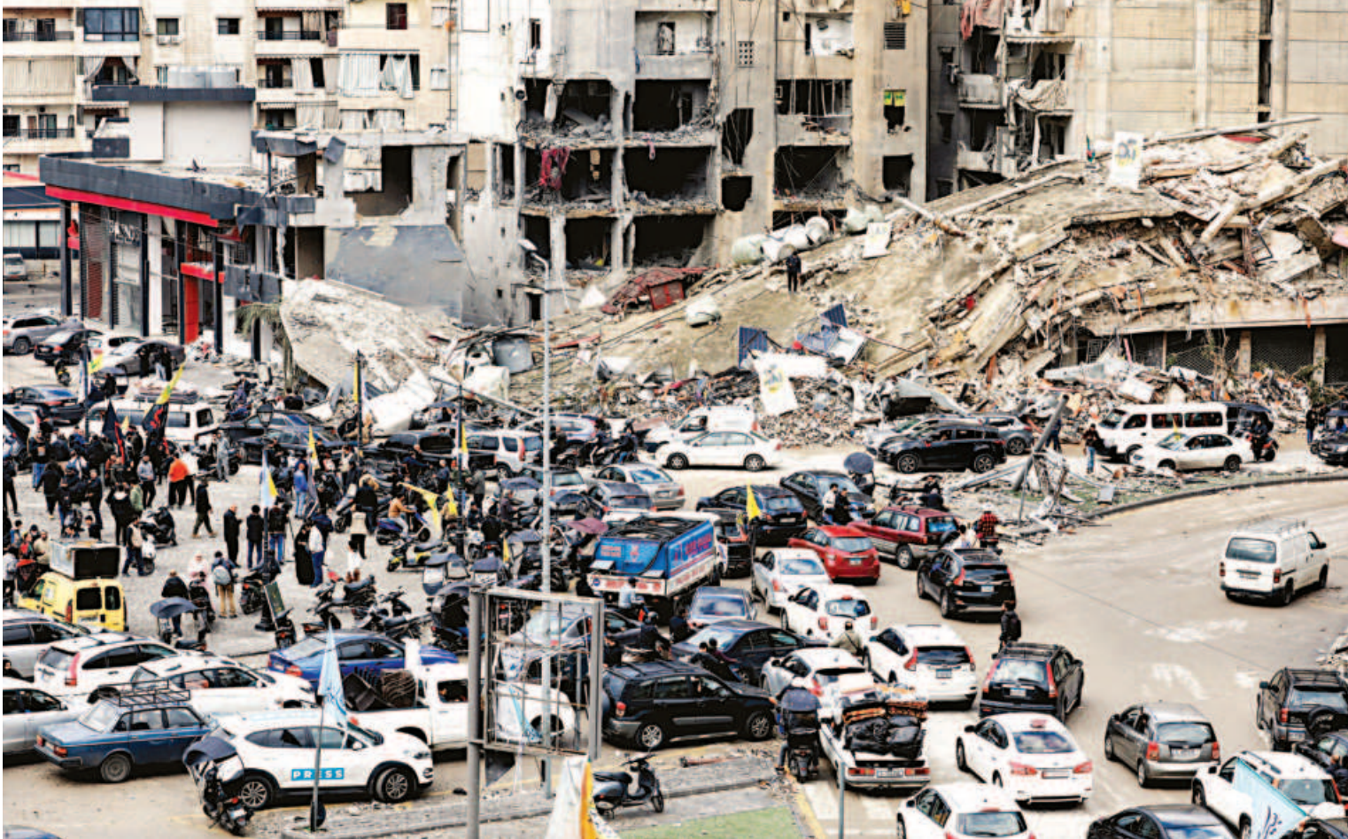
Cheering crowds gather as vehicles drive near damaged buildings in Beirut's southern suburbs after a ceasefire between Israel and Hezbollah took effect yesterday.