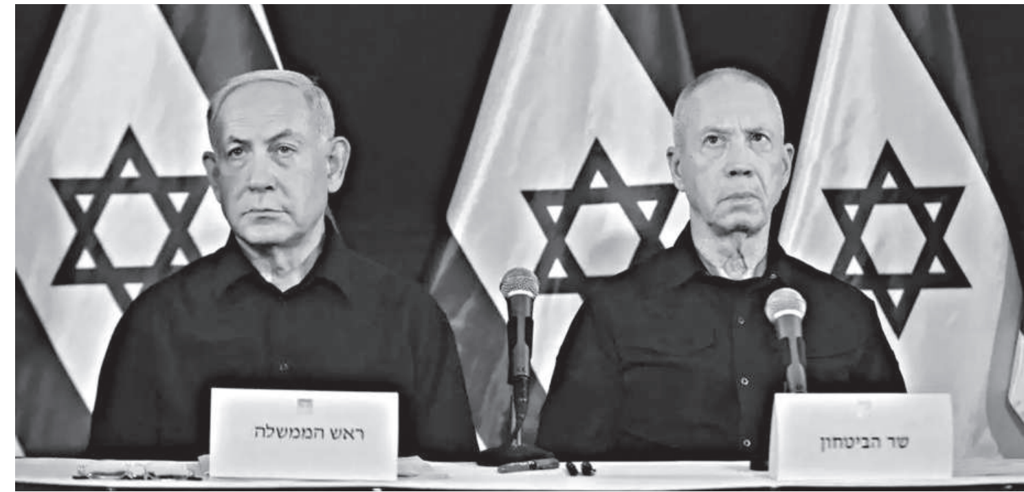
Israeli Prime Minister Benjamin Netanyahu and Defence Minister Yoav Gallant attend a press conference in the Kirya military base in Tel Aviv on October 28, 2023.