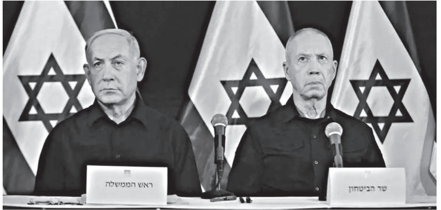
Israeli Prime Minister Benjamin Netanyahu and Defence Minister Yoav Gallant attend a press conference in the Kirya military base in Tel Aviv on October 28, 2023.

While the arrest warrants will not immediately alleviate the suffering of Palestinians in Gaza, the West Bank, or southern Lebanon, they are a step toward accountability. As ceasefire negotiations unfold, the US continues to assure Israel of