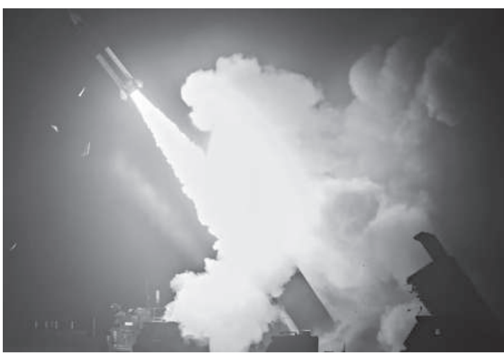
Ukraine fired long-range US missiles inside Russia for the first time despite Moscow's threats of retaliation.

Supporters may consider this an effort to leave a lasting foreign policy legacy. While his presidency is nearing its end, Biden may attempt to bolster Ukraine's military strength before any likely policy shift by the incoming administration. However, this move could complicate Trump's approach to Ukraine, as he often leaned toward reducing American involvement in the conflict. He could find himself in a position where reversing Biden's policies becomes a politically fraught