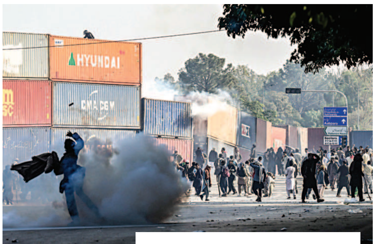
Policemen fire tear gas shells to disperse supporters of the Pakistan Tehreek-e-Insaf (PTI) party during a protest demanding the release of former prime minister Imran Khan, at the Red Zone area in Islamabad yesterday. Inset, PTI supporters attend a rally in Islamabad.