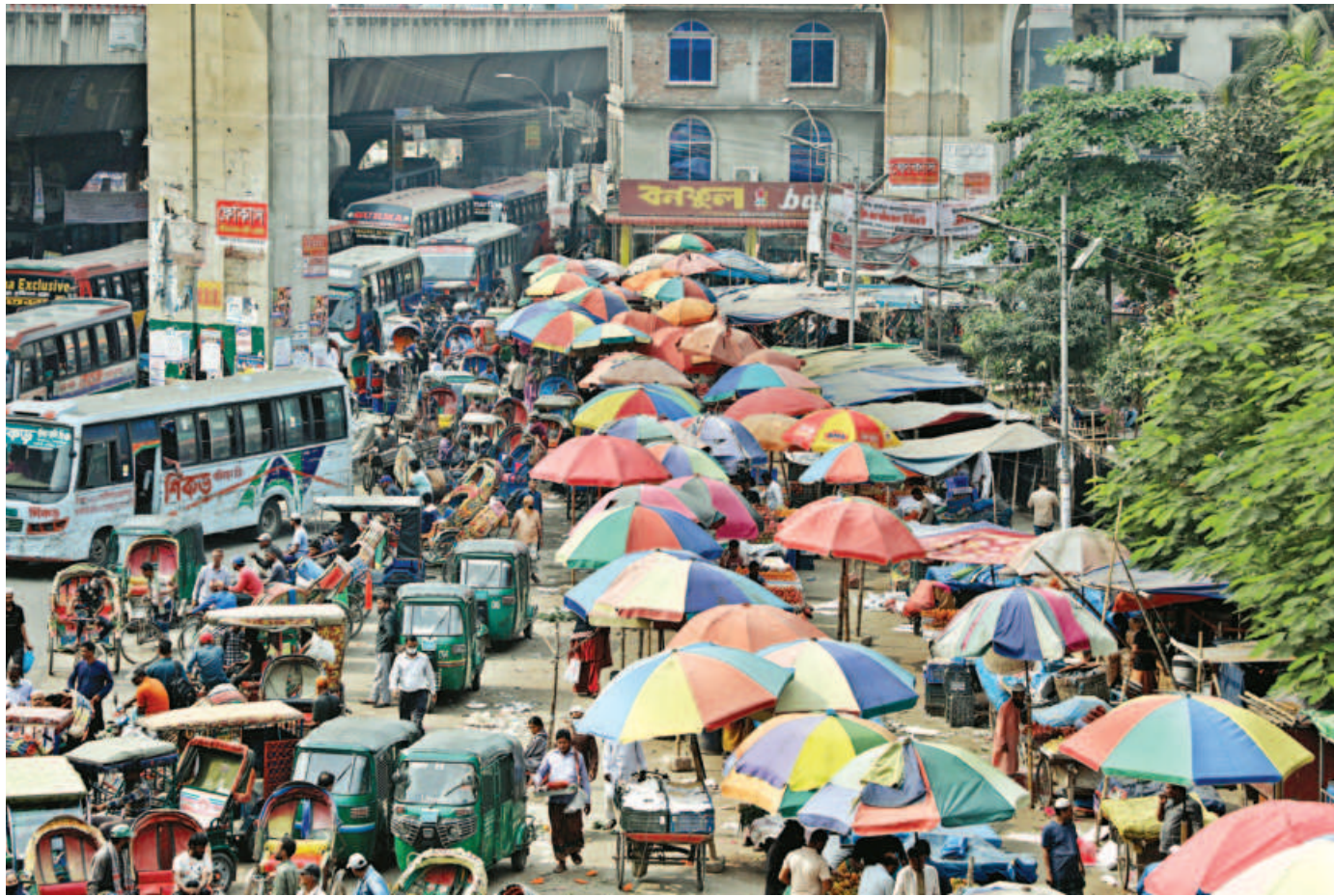
Makeshift shops have been set up by traders along the road at the capital's Jatrabari intersection, reducing the available space for traffic. Rickshaws and auto-rickshaws are also parked in the area, which further worsens the situation. The photo was taken yesterday.