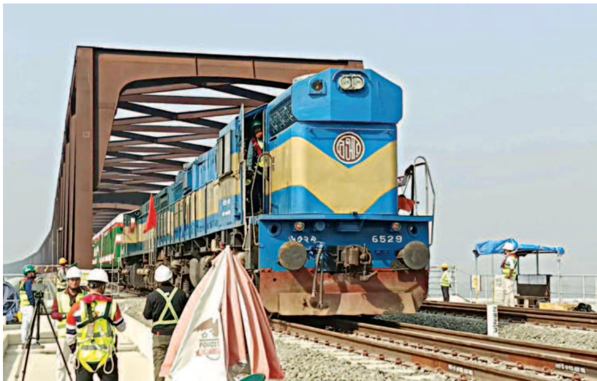
A train reaches the eastern end of the newly built Bangabandhu Sheikh Mujib Railway Bridge in Tangail's Bhupur during a trial run yesterday. The railway authorities conducted trial runs to evaluate the train's movement, speed, and key technical factors. The 4.8km bridge over the Jamuna is expected to be opened in January.