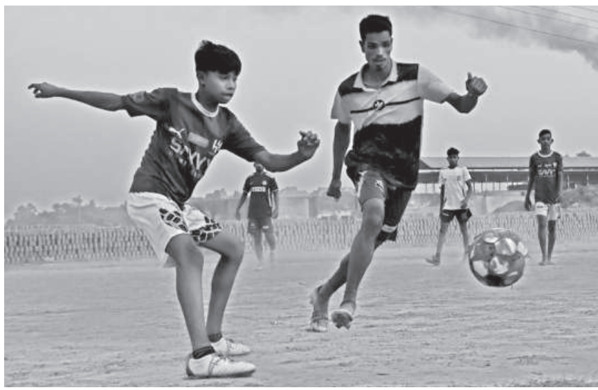
A group of boys plays football on an uneven field in the Khagail area of Companiganj upazila, Sylhet. Despite the lack of proper playing fields, they make do with this rough pitch, risking injuries to enjoy the game they love. The photo was taken recently.