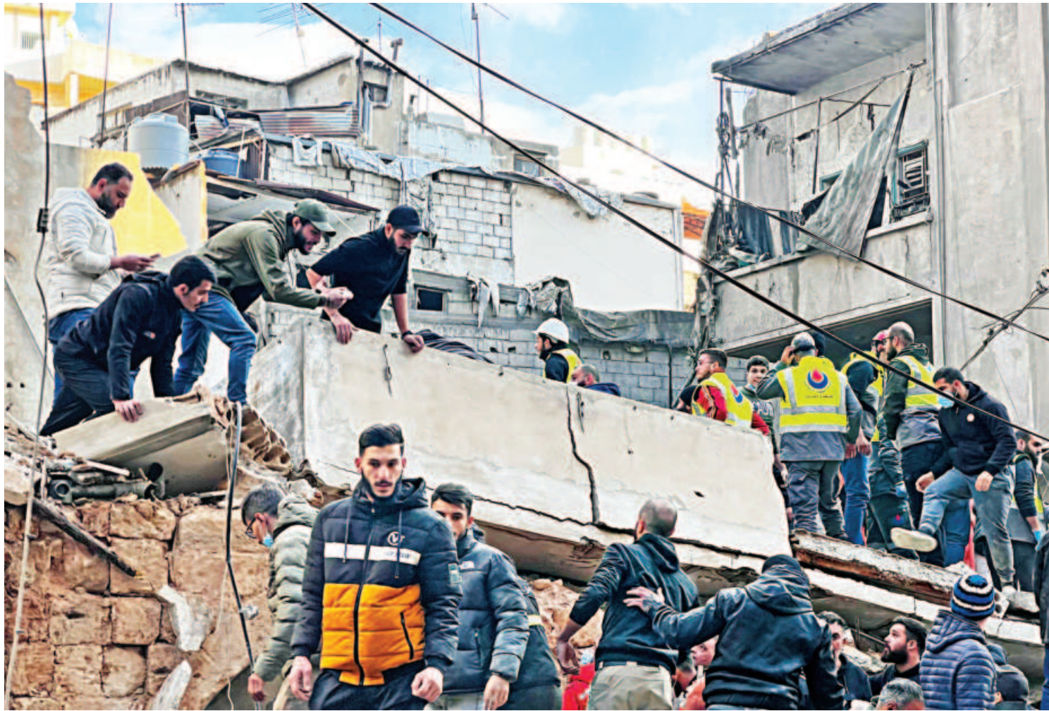
Lebanese first responders arrive at the site of an Israeli airstrike that targeted a building in the capital Beirut yesterday, amid the ongoing war between Israel and Hezbollah.