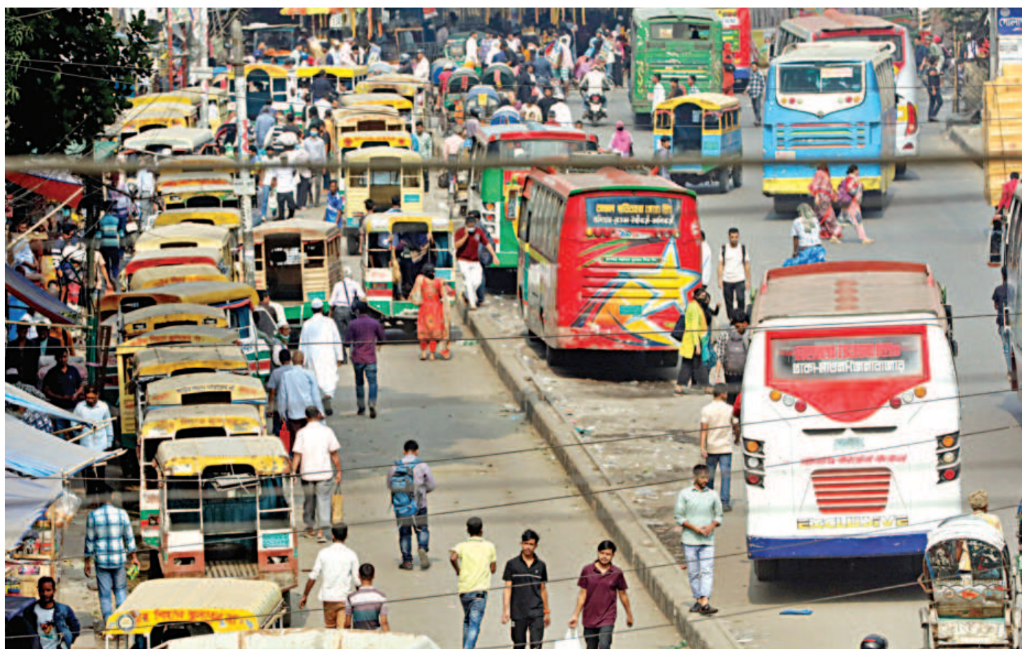
A line of human haulers and buses is parked on both sides of the same road, leaving little space for vehicles to pass. This type of illegal parking remains a persistent issue plaguing the capital. The photo was taken at Golap Shah Mazar in Gulistan yesterday.