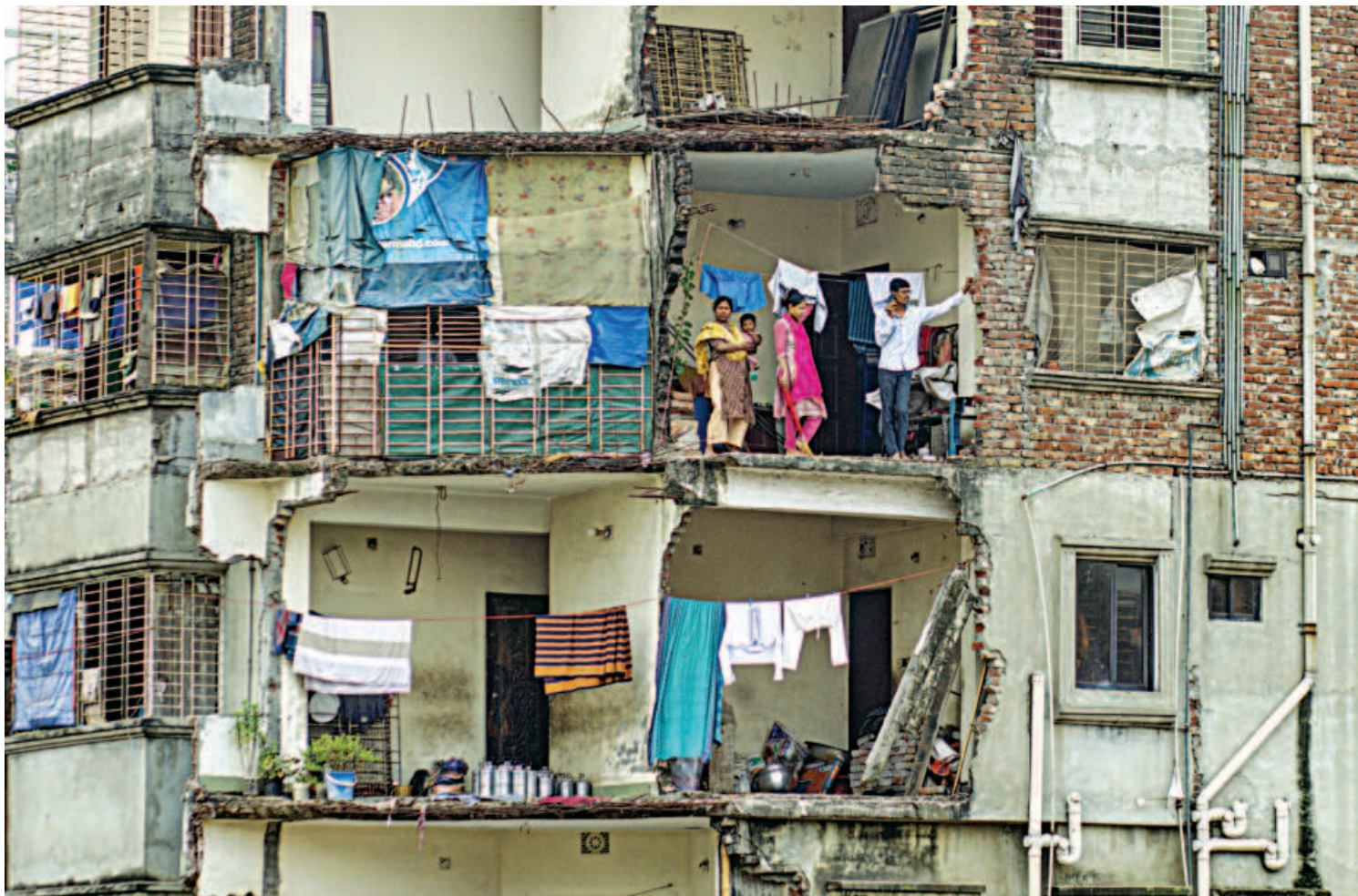
Over a year ago, a part of this residential building was knocked down during an eviction drive to reclaim an old channel of the Buriganga in the capital's Kamrangirchar. With no repairs made since then, people are still residing in the building, exposing themselves to potential danger. The photo was taken on Sunday.