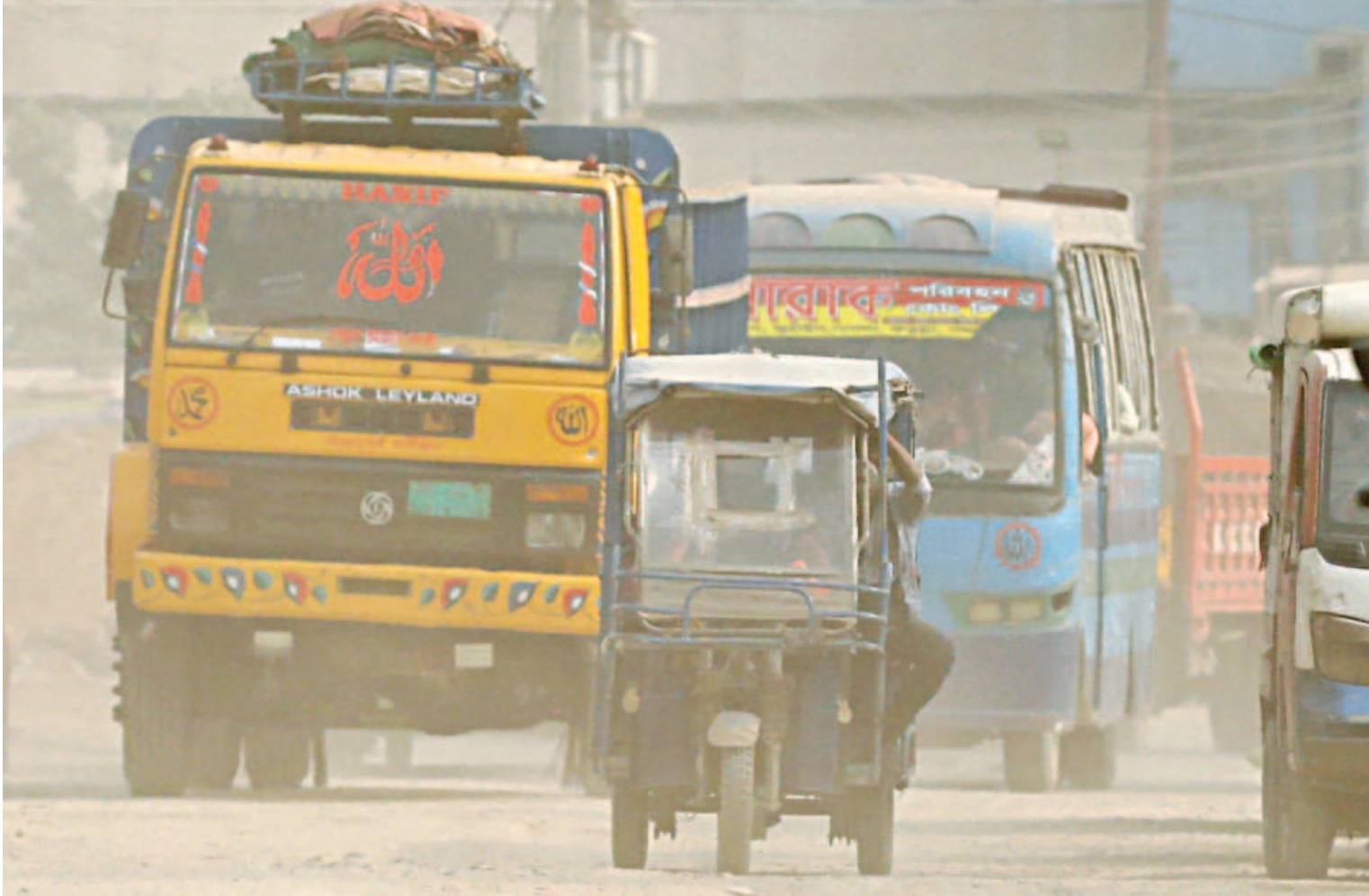
Dust envelops the air, obstructing the visibility of vehicles and passersby on Pagla Postogola Road in Narayanganj yesterday. Air pollution, especially dust pollution, continues to plague Bangladesh year-round, with conditions worsening during winter.