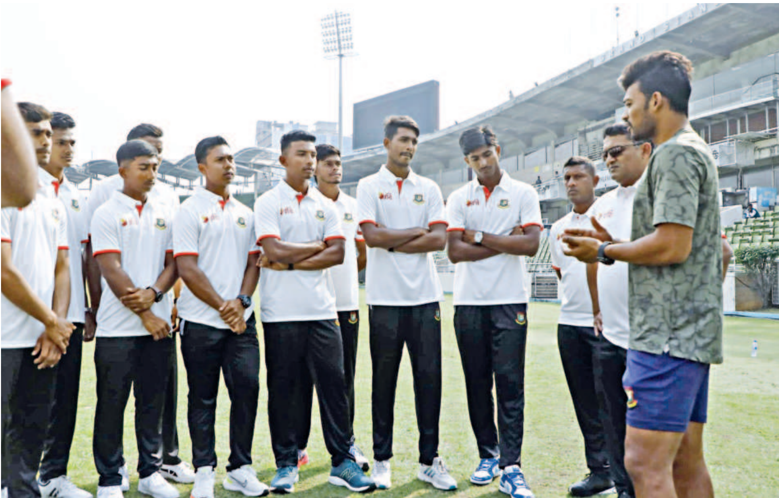
Bangladesh's all-format captain Najmul Hossain Shanto gives some tips to Young Tigers during an official photo session at the Sher-e-Bangla National Cricket Stadium in Mirpur yesterday, ahead of the ACC U-19 Men's Asia Cup 2024 in the UAE. The team will depart for the tournament today.

In reply, Chattogram openers saw through nine overs, scoring 31 at the SICS Academy Ground.