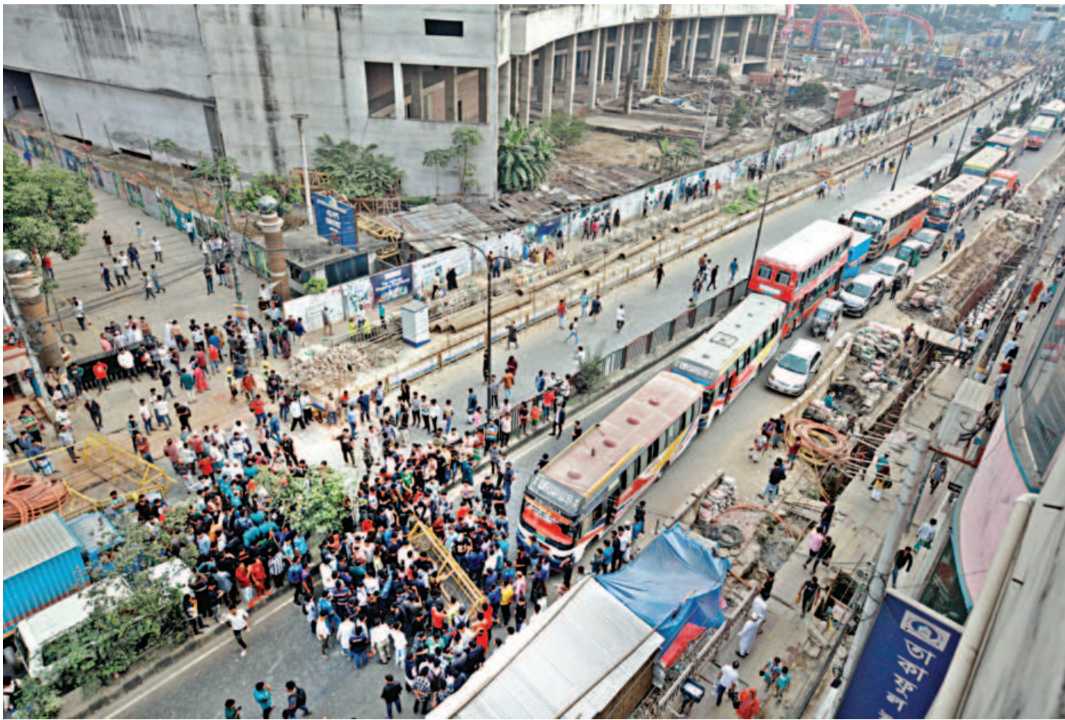
Traders and their employees blocked the Pragati Sarani in front of the capital's Jamuna Future Park yesterday morning to protest the recent thefts at several shops in the mall. The protest led to a severe traffic congestion on the road.

Besides, 81,456 dengue patients have been discharged till yesterday.