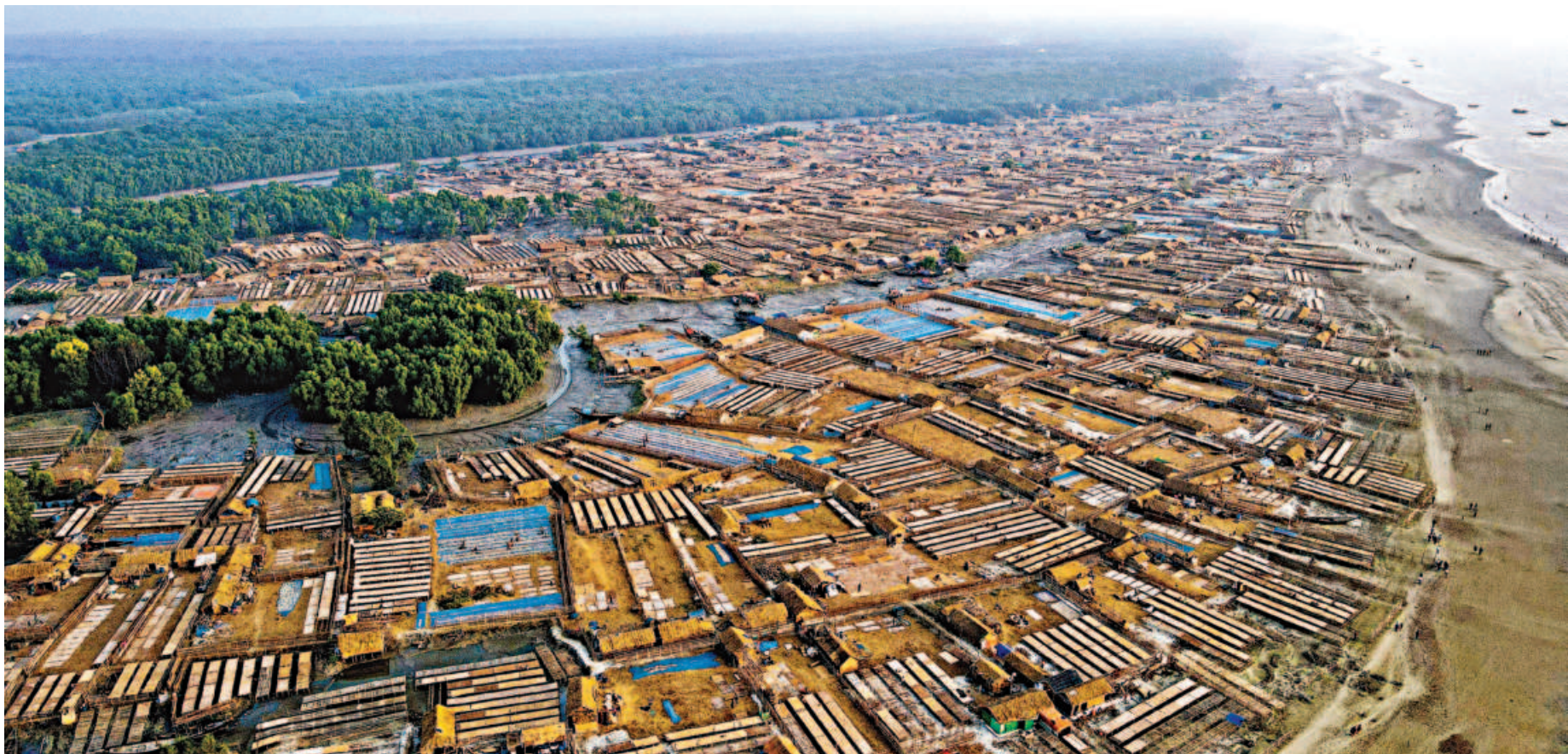
Dublar Char of the Sundarbans hosts one of the largest dried fish markets in the country -- Shutki Palli. Dried fish worth around Tk 300 crore is sent all over the country from this market. Local fishermen are allowed to catch and dry fish for six months every year, and over 35 thousand people are involved in the process of making shutki, which takes around three to five days. Wholesalers buy the dried fish from here at Tk 500-550 per kg. The photo was taken recently.