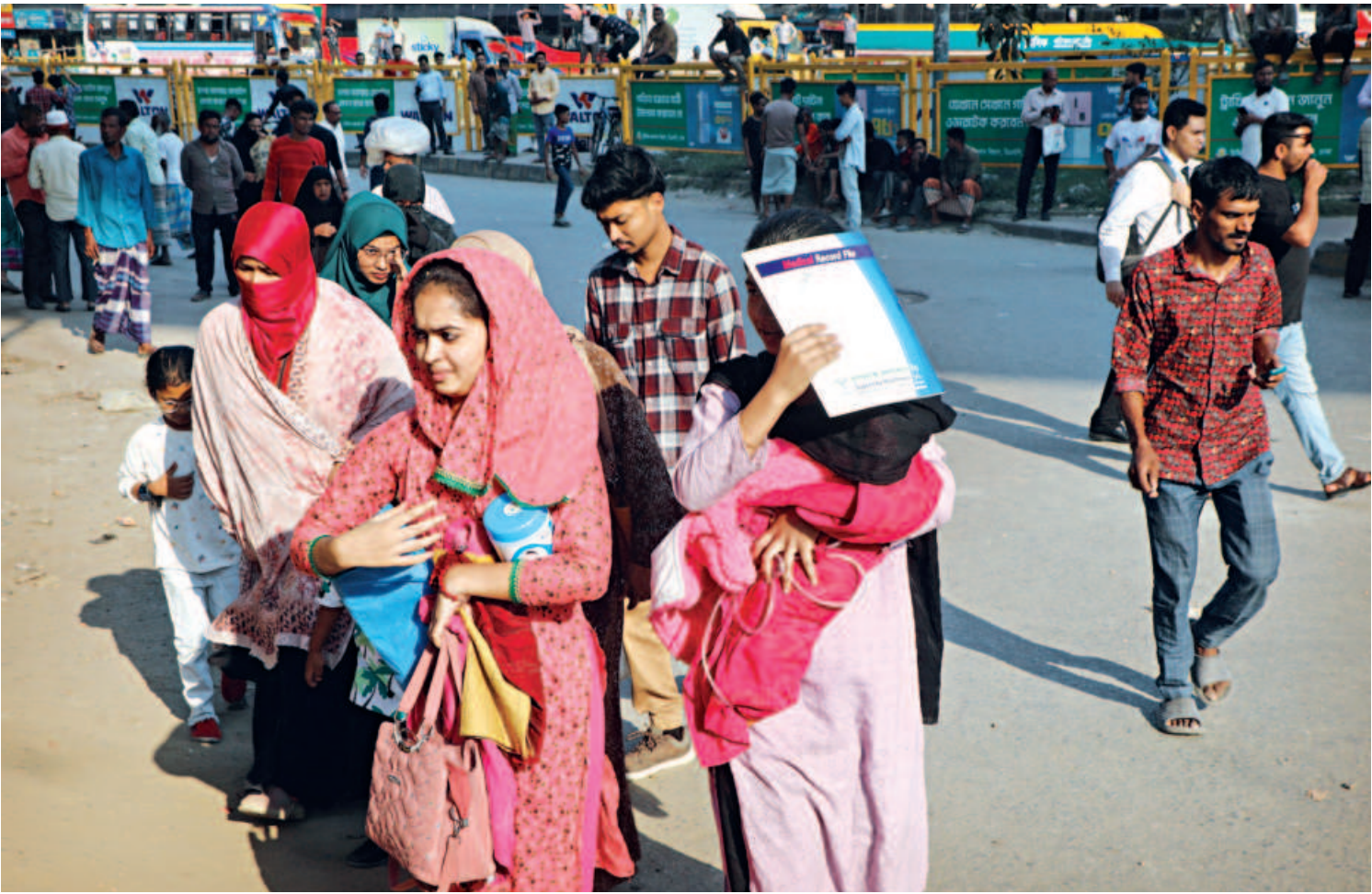
A woman carrying her baby, along with other family members, had to walk a long distance to return home from a hospital in Dhaka yesterday. Their hardship was a result of the ongoing blockade by battery-run rickshaw drivers demanding rehabilitation. The photo was taken near the Mohakhali level crossing.