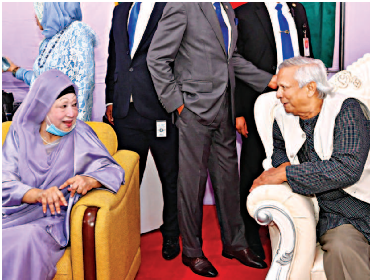
Chief Adviser Prof Muhammad Yunus exchanges greetings with BNP Chairperson Khaleda Zia at a reception organised at the Dhaka Cantonment to mark the Armed Forces Day yesterday. Story on page 2.