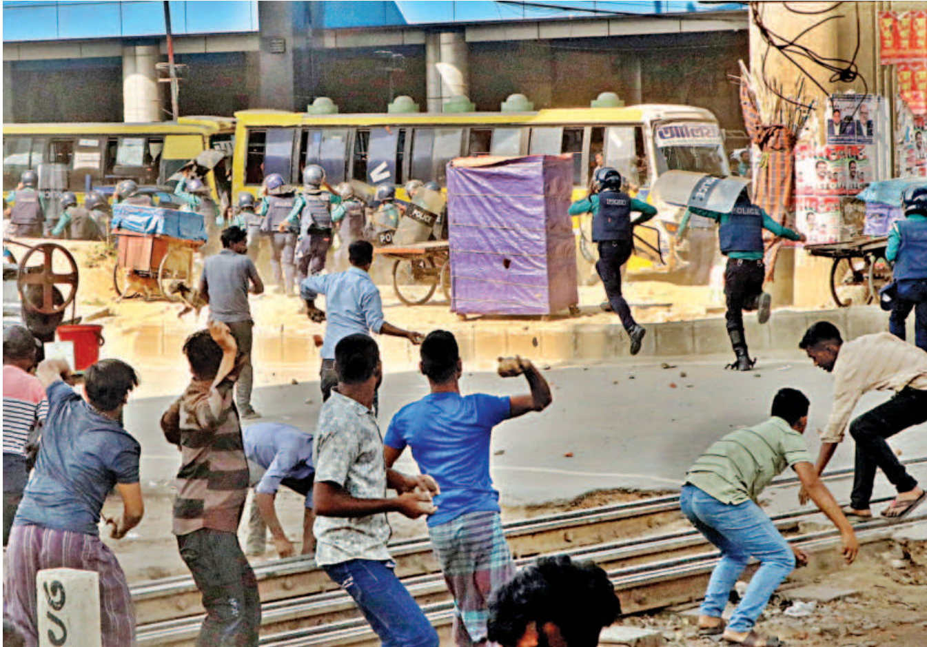
Battery-run rickshaw drivers, who were blocking the Mohakhali rail tracks yesterday, throwing brickbats and stones to chase away the police officials after army personnel dispersed them.