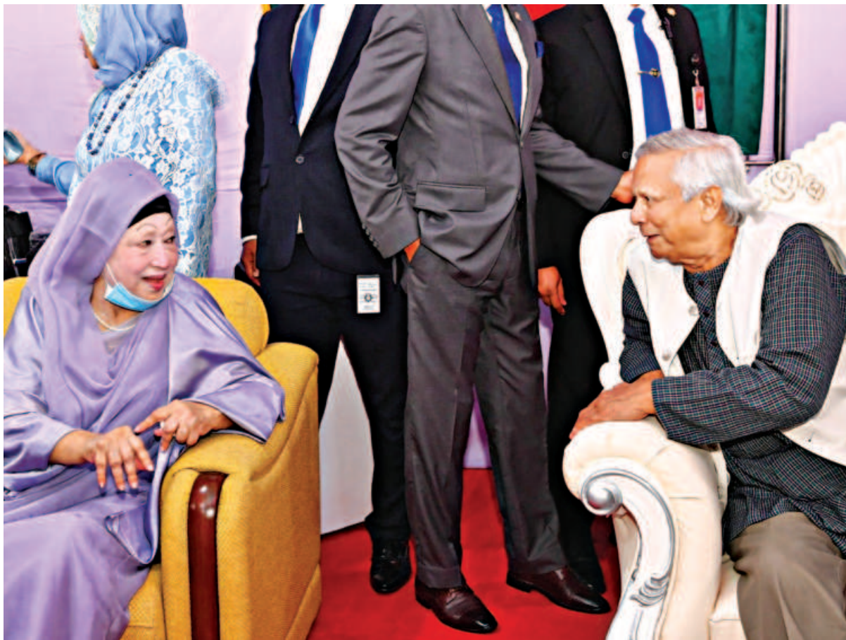
Chief Adviser Prof Muhammad Yunus exchanges greetings with BNP Chairperson Khaleda Zia at a reception organised at the Dhaka Cantonment to mark the Armed Forces Day yesterday. Story on page 2.