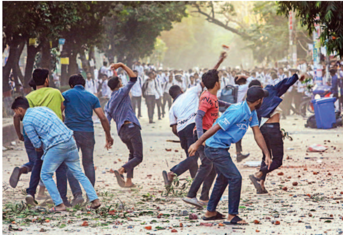
Students of Dhaka College and Dhaka City College clash in the capital's Science Lab area yesterday afternoon. According to police, the clash broke out after a Dhaka College bus was vandalised. The clash left at least 15 people injured. Story on page 3.