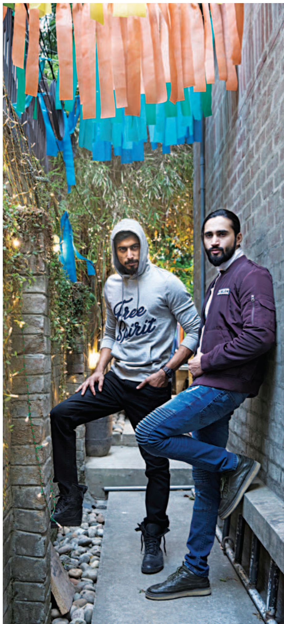
Photo: Blazers from Richman, LS Archive Sazzad Ibne Sayed – Twelve Clothing