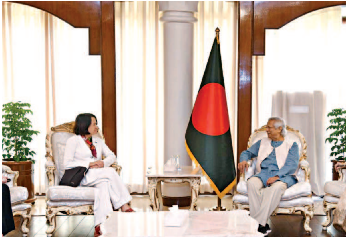
Chief Adviser Prof Muhammad Yunus at a meeting with UK Parliamentary Under-Secretary of State for Indo-Pacific Catherine West at the State Guest House Jamuna in Dhaka yesterday.