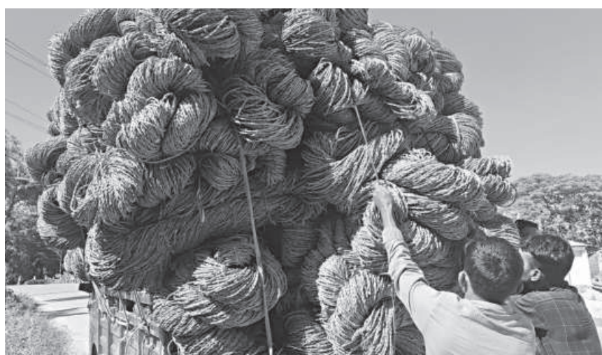
Workers fill a pickup with ropes made from Hogla leaves (elephant grass). The cargo will be transported to Rajbari in Faridpur, where it will be sold. The photo was taken in Laharhat area of Barishal Sadar upazila recently.

He served as the 18th chief justice from February 8, 2010 to September 29, 2010.