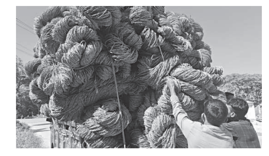
Workers fill a pickup with ropes made from Hogla leaves (elephant grass). The cargo will be transported to Rajbari in Faridpur, where it will be sold. The photo was taken in Laharhat area of Barishal Sadar upazila recently.