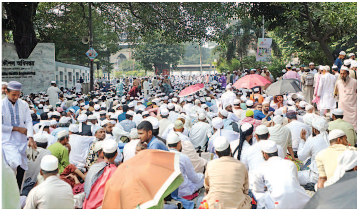
Followers of the Tablighi Jamaat faction loyal to Maulana Mohammed Saad Kandhalvi gather in and around the Kakrail Mosque in the capital yesterday as per its scheduled programme. The photo was taken before the Juma prayers.