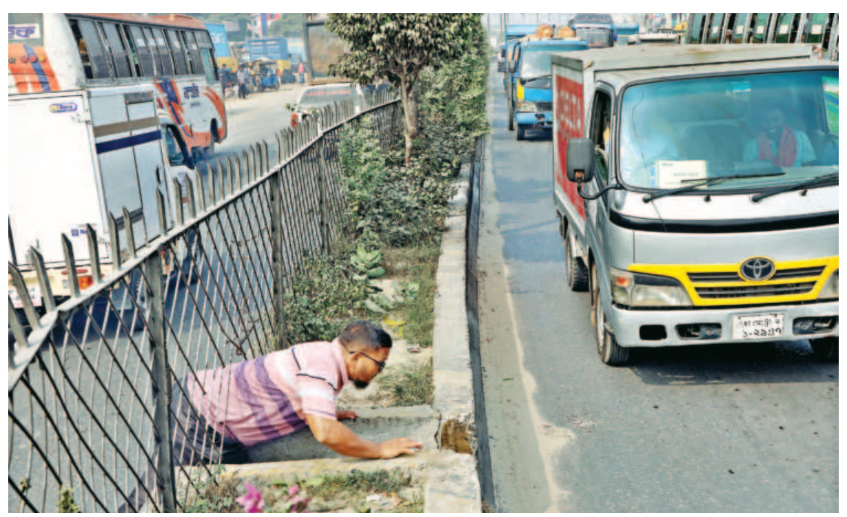
A man crawling through a small opening in a road divider to get across the Dhaka-Aricha highway in Savar's Hemayetpur, putting himself and the other road users at risk. Although a footbridge, not in picture, is located just about 60 metres away, many pedestrians still choose to jaywalk. The photo was taken on Thursday,