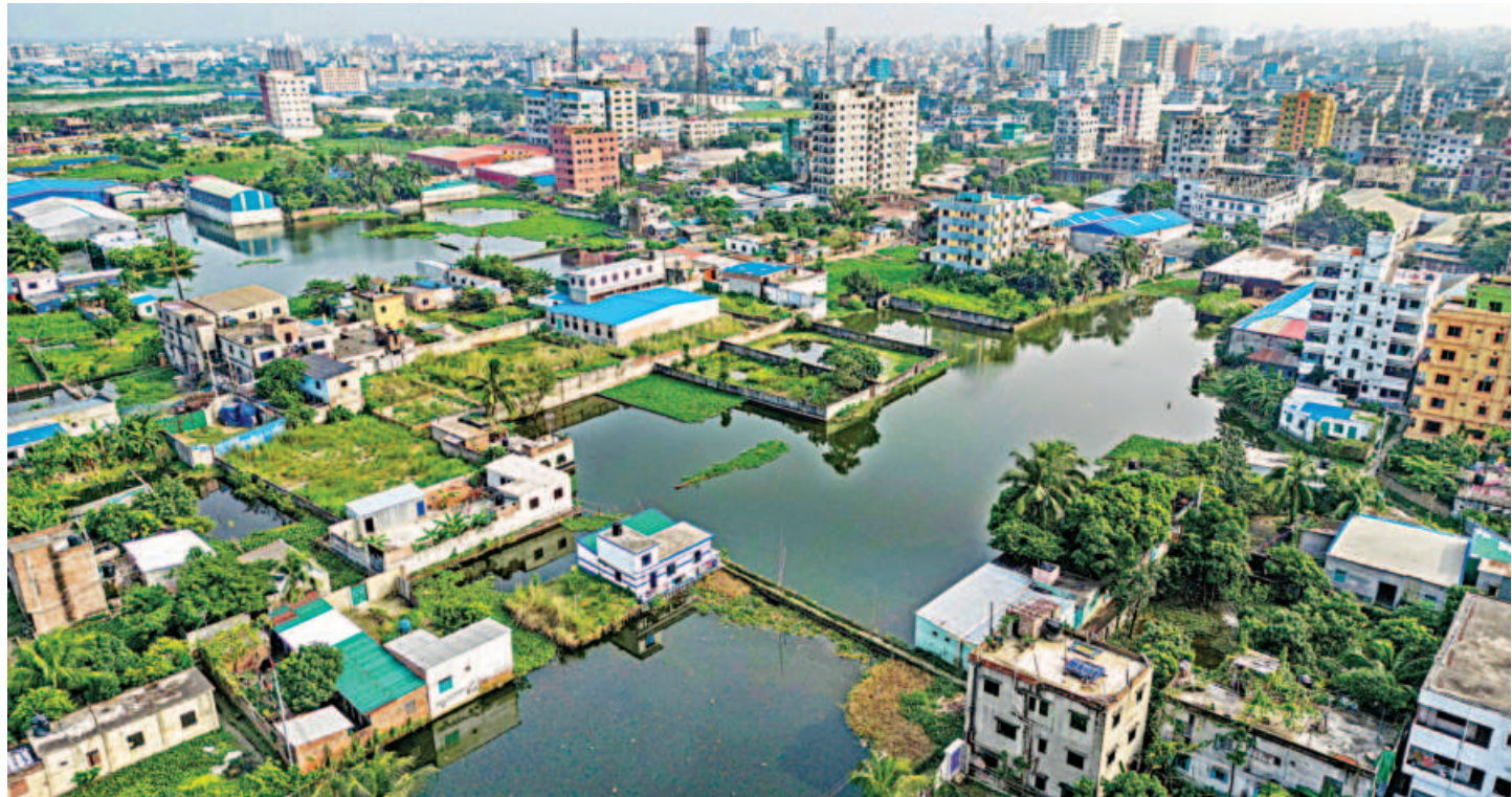
Unplanned and unregulated development of residential and factory buildings in Narayanganj's Fatulla area has caused waterlogging. Many homes can only be accessed via bamboo bridges, thanks to the absence of a drainage system. The area remains flooded almost all the year round, contributing to water pollution. The photo was taken recently.