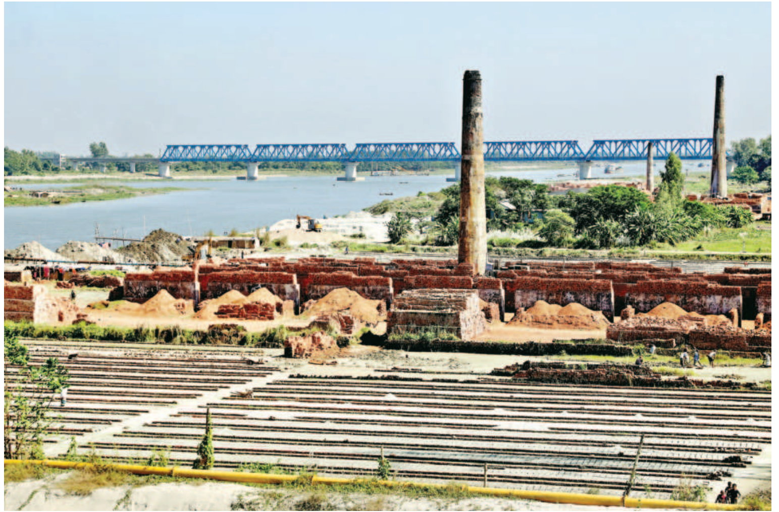
Brick kilns set up on the Dhaleshwari are contributing to air pollution in the Nimtoli area of Munshiganj's Sirajdikhan upazila. Sand traders have also occupied a part of the riverbank, further reducing the river's width. The photo was taken yesterday.