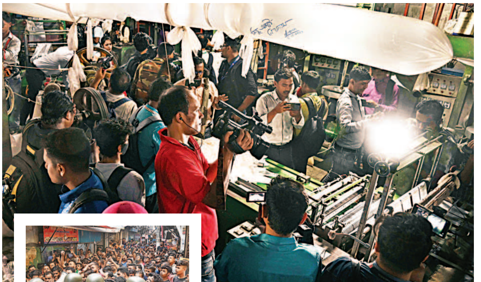
As part of an initiative by the environment ministry, a raid was conducted in the Lalbagh area of Old Dhaka, targeting polythene factories, yesterday. Several factories were sealed off during the operation. Inset, protesting the drive, factory workers demonstrated in the area, which ultimately led to the magistrate halting the operation.

He further said Mujib's photo was removed by officers because of his daughter's "fascist rule" in the name and spirit of her post-'71 "authoritarian father".