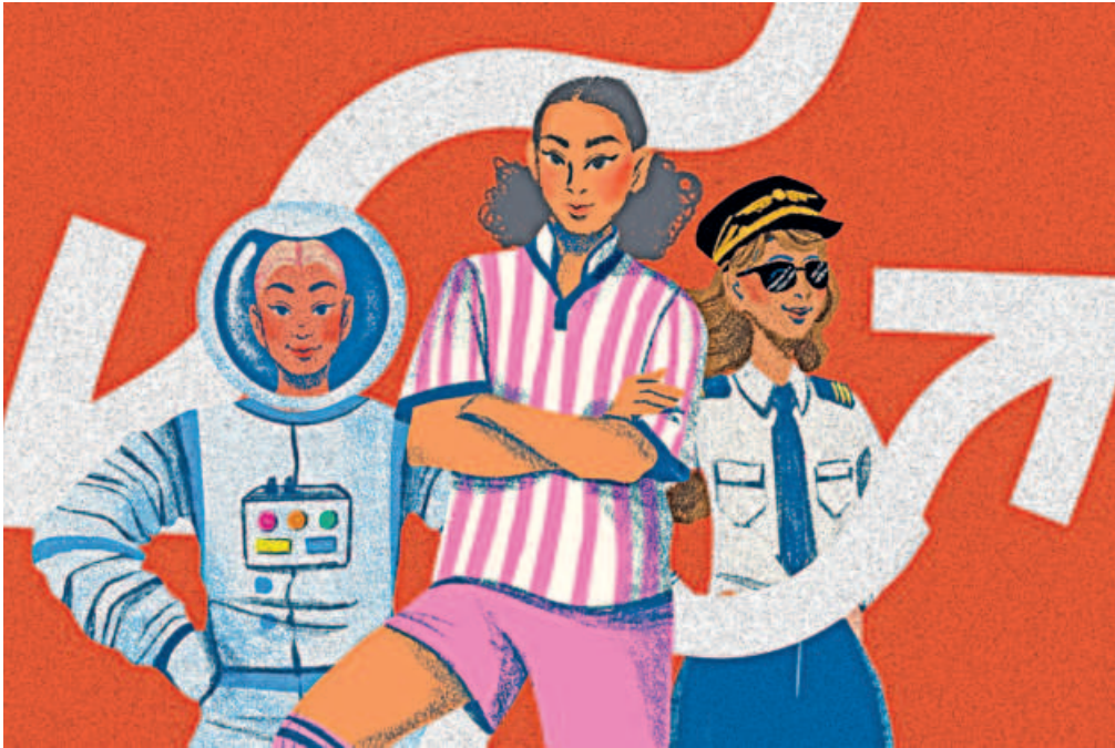
ILLUSTRATOR: ZARIF FAIAZ

Nonetheless, whether you are new or old in your field, it is always a wise idea to consult someone more experienced than you, so you can gain insight into how far your industry-relevant skills have developed and how well you can potentially fare in a completely new