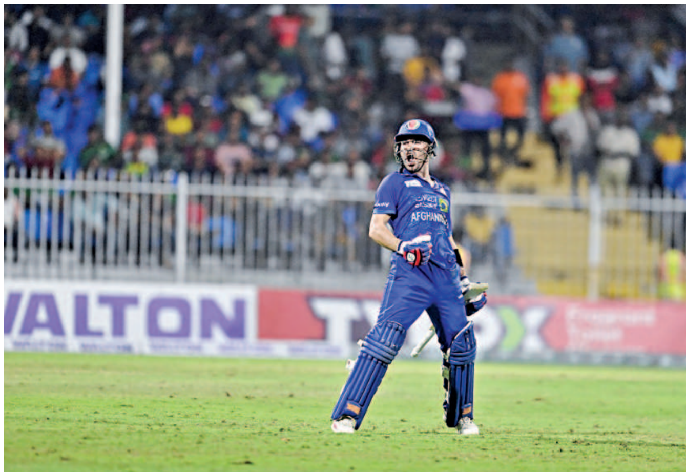
Afghanistan opener Rahmanullah Gurbaz celebrates his century against Bangladesh in the third and deciding ODI at the Sharjah Cricket Stadium in the UAE yesterday. Gurbaz's 101 helped his side chase down Bangladesh's 244-run total with five wickets in hand and 10 balls to spare, sealing a 2-1 series win.