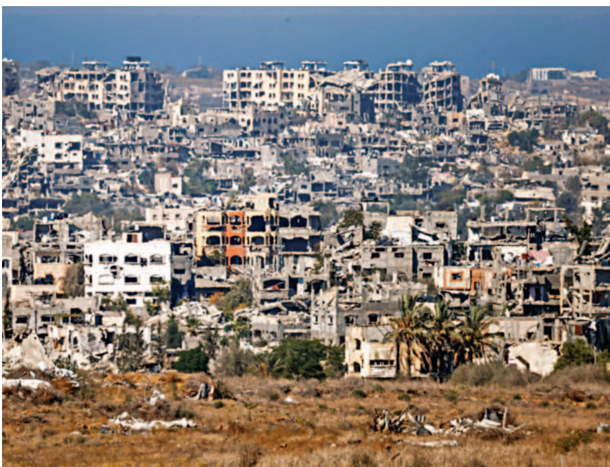
A general view shows destroyed buildings in northern Gaza, amid the ongoing Israeli offensive in the Palestinian enclave, near the Israel-Gaza border yesterday.

With the offensive in Gaza now in its 14th month, Israel is focusing its operations in the north and centre in what it says is a campaign to stop Hamas members waging attacks and to prevent them from regrouping.