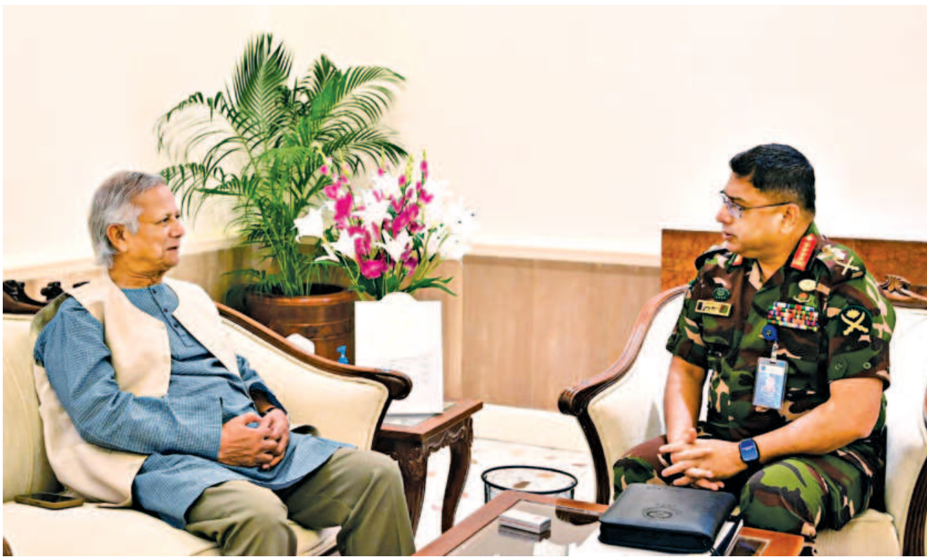
Army Chief General Waker-Uz-Zaman called on Chief Adviser Prof Muhammad Yunus at the latter's office in the capital's Tejgaon yesterday.