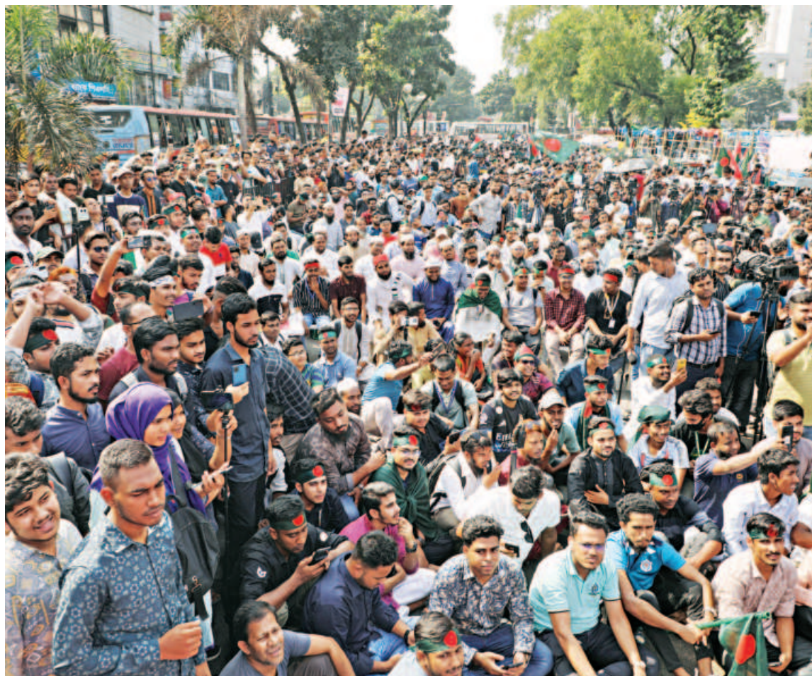
In observance of Noor Hossain Day, several political organisations placed wreaths at the Noor Hossain Square in the capital's Zero Point area yesterday. Meanwhile, determined to resist the Awami League's bid to bring out a procession towards Zero Point, leaders and activists of the Anti-discrimination Student Movement, BNP, and Jamaat took positions in Bangabandhu Avenue and Zero Point areas. At least 10 people were beaten up in Gulistan and neighbouring areas in suspicion of being associated with AL and its front organisations. Some of them were handed over to police.

A total of 69,922 dengue cases have been reported since January 1, 2024.