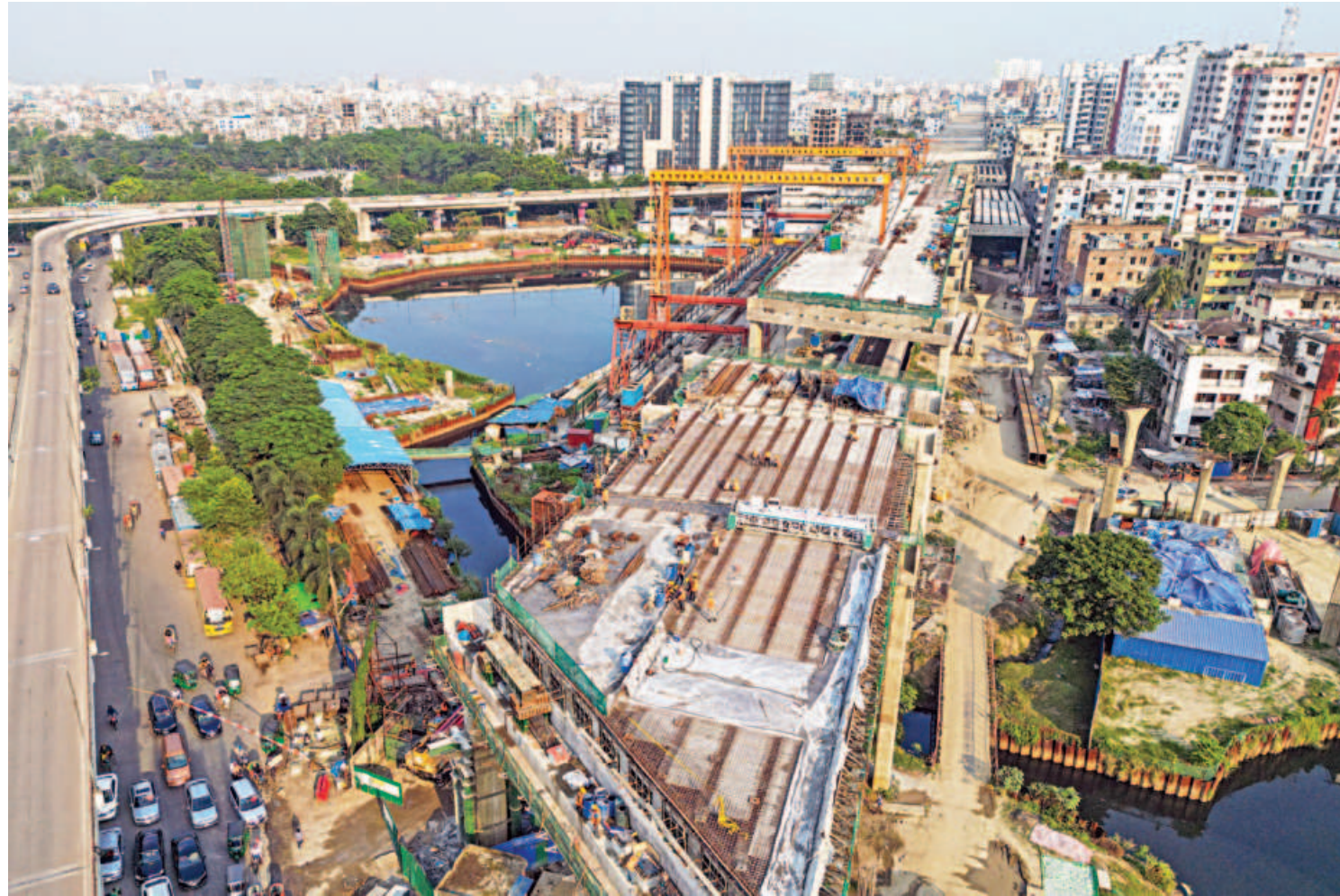
Work on the Dhaka Elevated Expressway resumes near FDC in the capital after a dispute over shares between the private partners of the public-private project halted work for over nine months. The photo was taken yesterday.