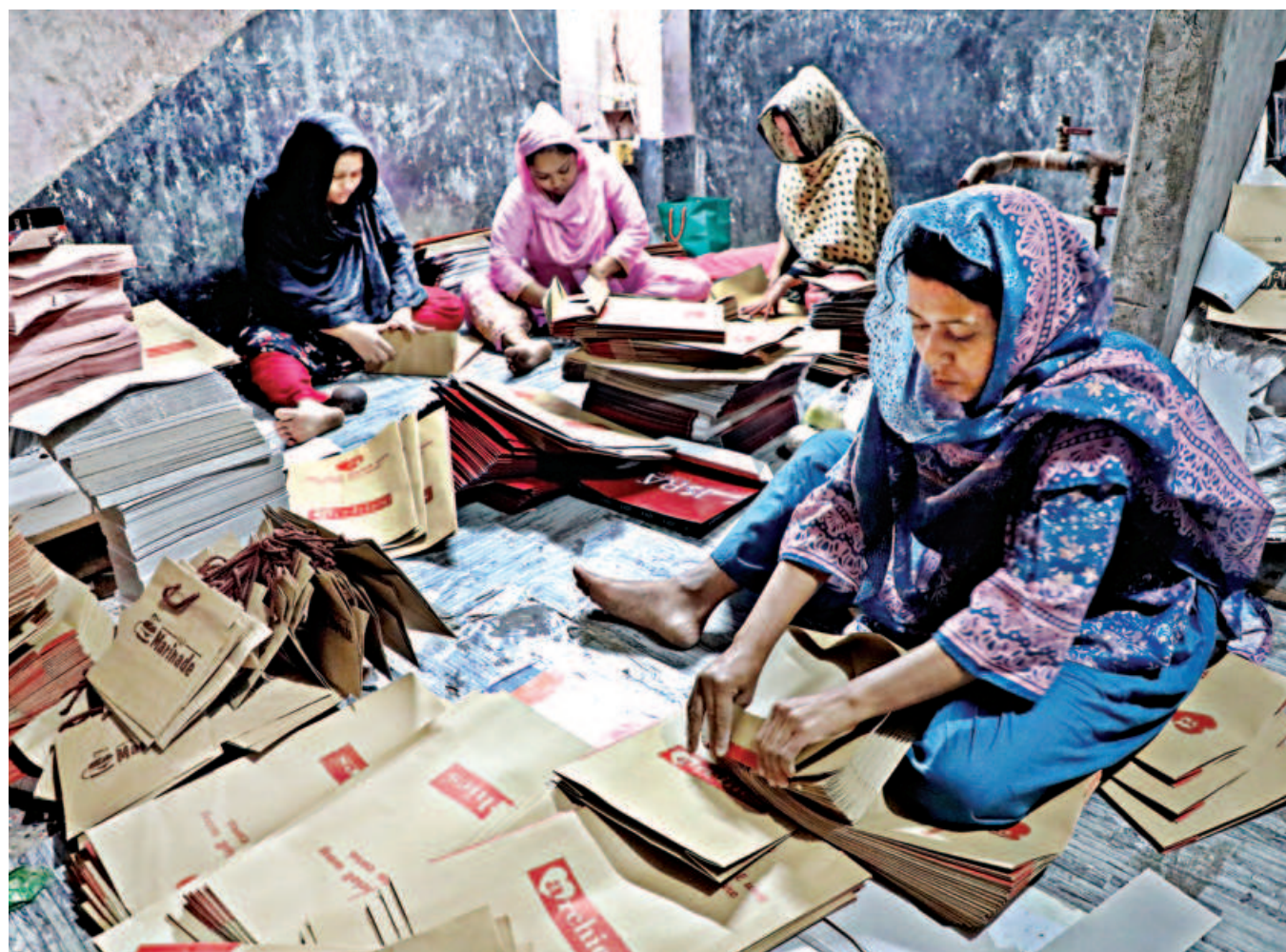
Women making paper bags in Jindabazar, Old Dhaka yesterday. With the ban on plastic bags in force, the demand for eco-friendly packaging is on the rise.