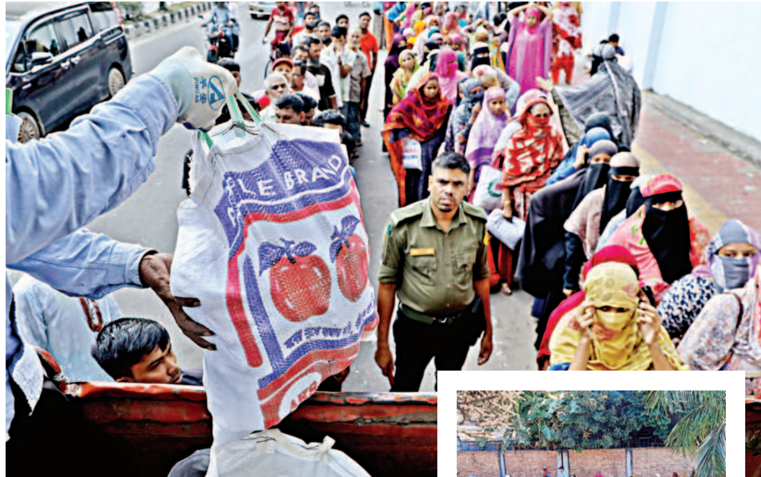
People queue up in front of a TCB truck in the capital's Kakrail area to purchase daily commodities at subsidised prices. Inset, another group of people, who had been waiting patiently for a TCB truck sit on the sidewalk hopelessly in the Hatirjheel area as the truck did not show up. The photos were taken yesterday.