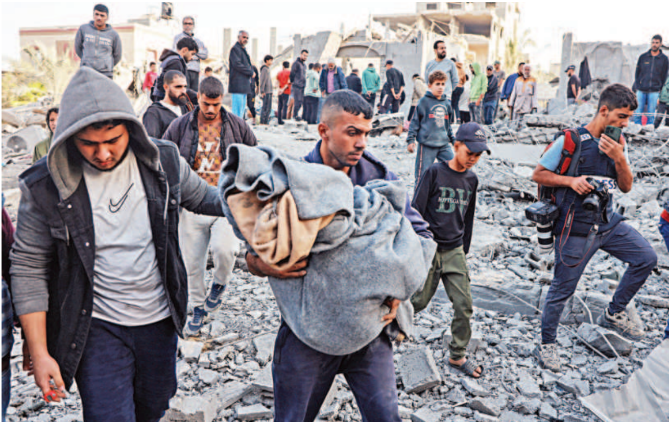
A man carries the dead body of a Palestinian at the site of an Israeli strike on a house in Nuseirat in the central Gaza Strip yesterday.

“The outcome of this election is not what we wanted, not what we fought for, not what we voted for, but hear me when I say - hear me when I say: The light of America’s promise will always burn bright,” she said. The somber mood was in striking contrast to the homecoming celebration a few weeks ago on the Howard campus when thousands of students and alumni gathered ahead of what they hoped would be the election of the country’s first graduate of historically Black Colleges and Universities as president. Harris addressed a crowd on Wednesday that included former House Speaker Nancy Pelosi, aides in President Joe Biden’s White House and thousands of fans.