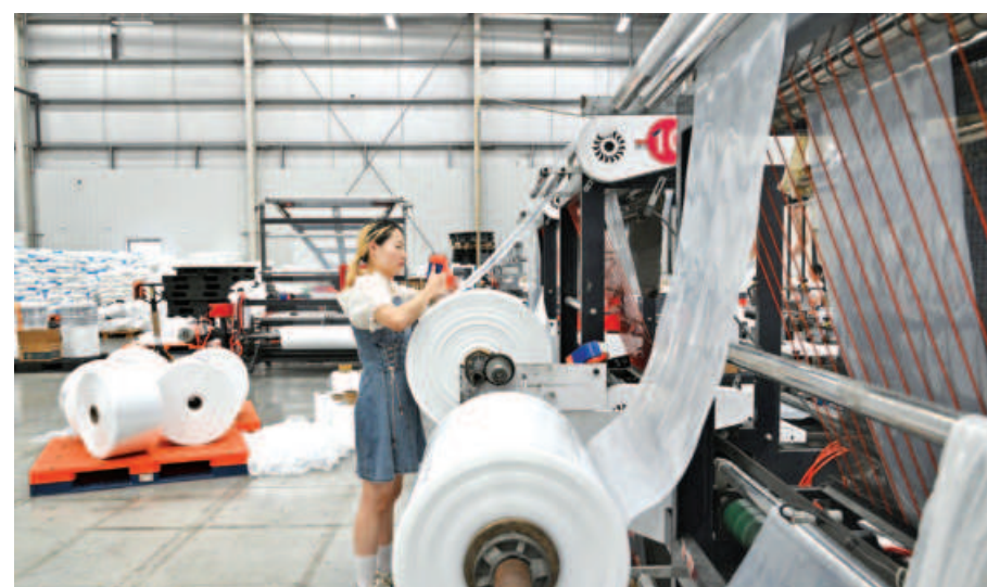
An employee works at a plastic factory in Yiwu, China's eastern Zhejiang province. Taking into account the probable retaliatory measures from Beijing and Brussels, the impact on the European Union economy will be $533 billion through 2029, $749 billion for the United States and $827 billion for China, according to a study.