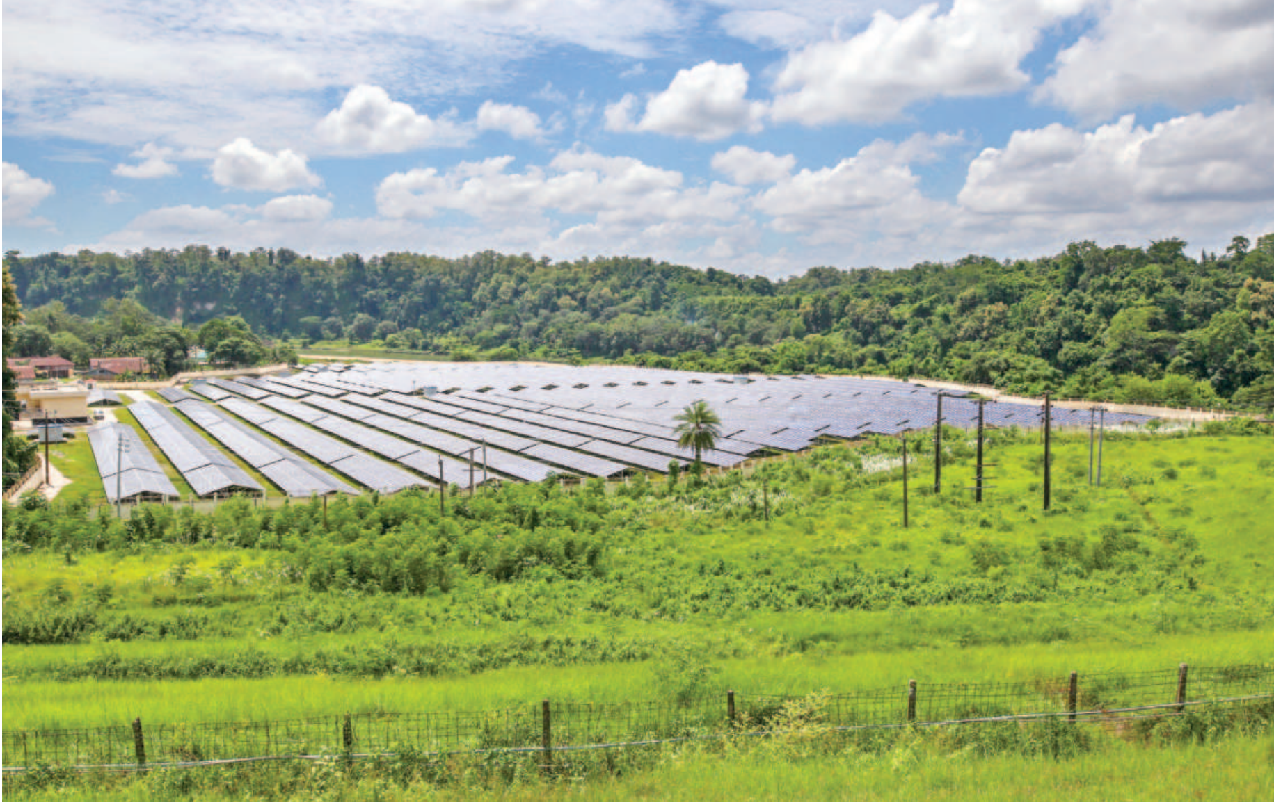
As of June 2023, renewable resources, including solar, wind, hydro and biomass, collectively hold an installed capacity of 1,183MW, constituting a meagre 4.5 percent of the country's total installed capacity.