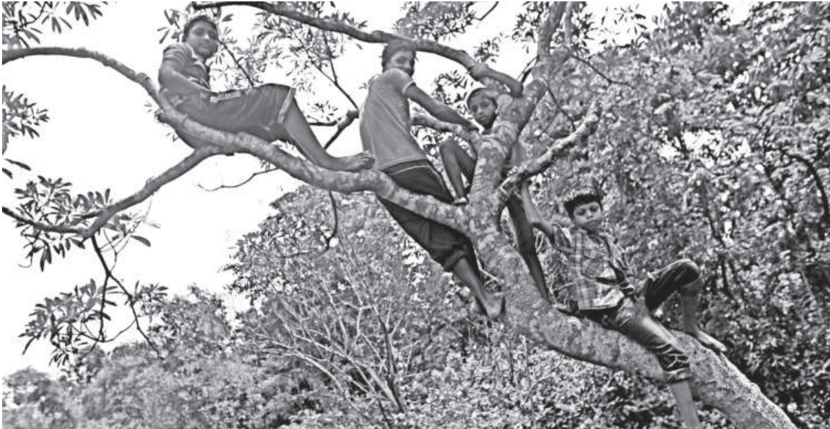
A group of boys have climbed this tree and are engaged in their own creative games. Away from the screens that dominate most a city dweller's life nowadays, these kids are a reminder of how one can creatively keep themselves entertained. The photo was taken from the Mugolgaon area of Sylhet yesterday.

She was first taken to Sarishabari Upazila Health Complex from where she was referred to Mymensingh Medical College Hospital. She succumbed to her injuries on the way to MMCH.