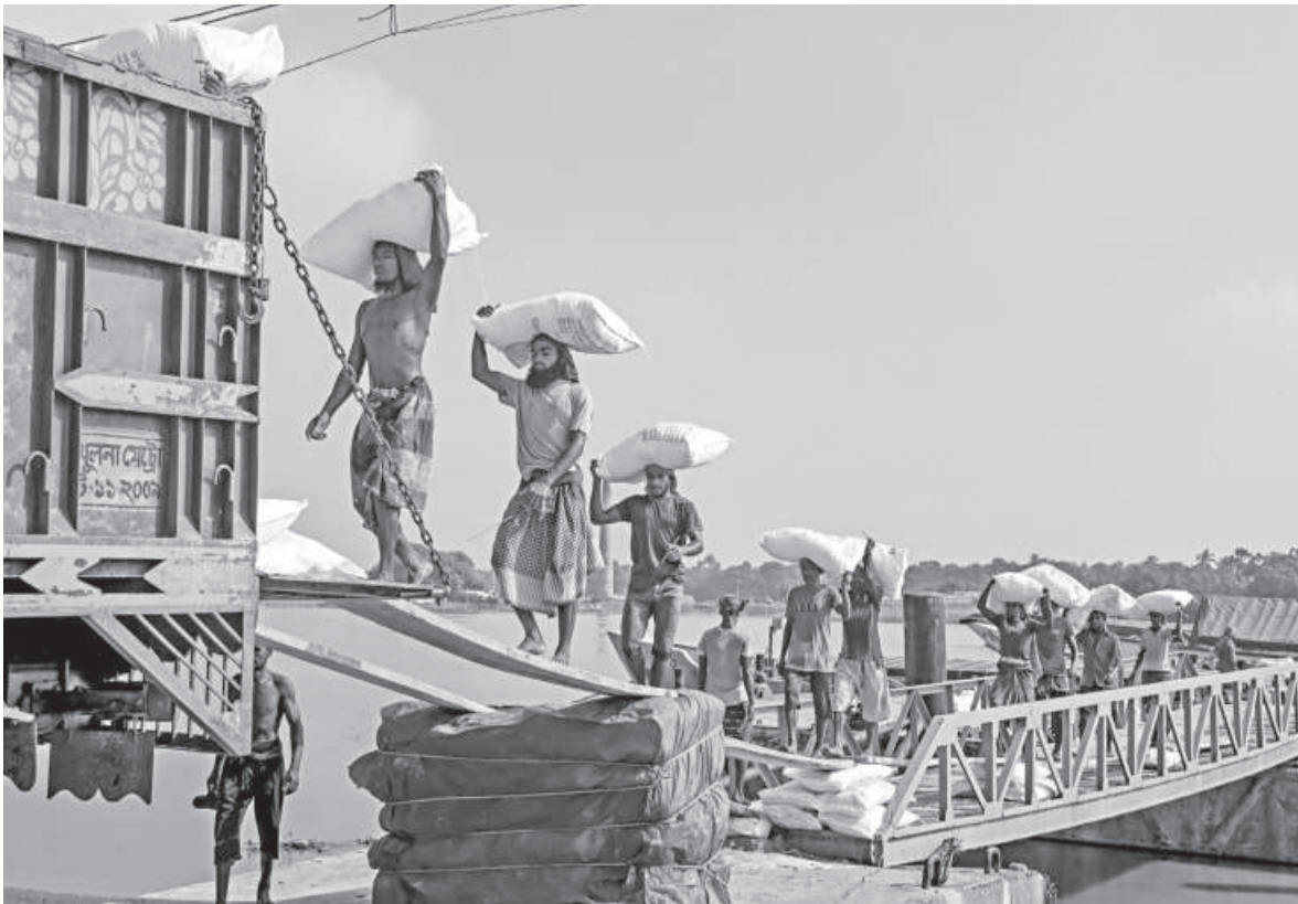
Workers take sacks of fertiliser from a ship and load them onto trucks after walking on a flimsy wooden platform. They are paid Tk 7 for each bag they load onto the truck and earn around Tk 700-800 per day on average. The photo was taken from Khulna Ghat 7 yesterday.

Moniruzzaman was not available for comments as his mobile phone was found switched off.