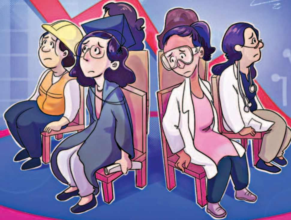
ILLUSTRATION: NATASHA JAHAN